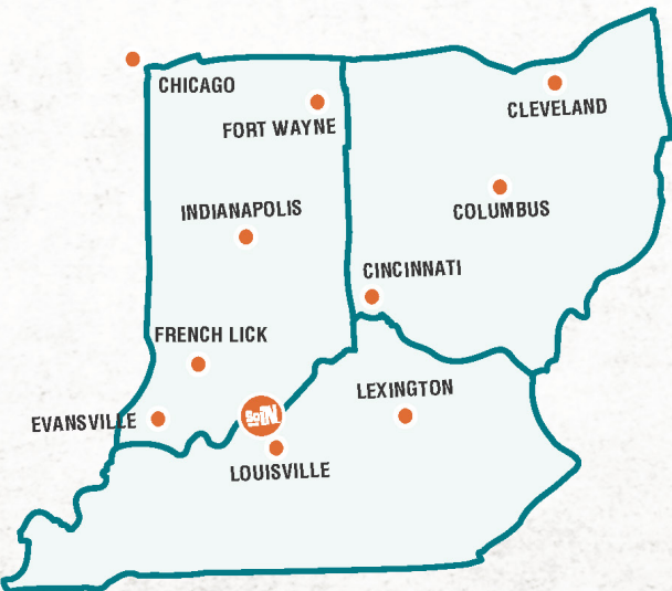
Miles From SoIN