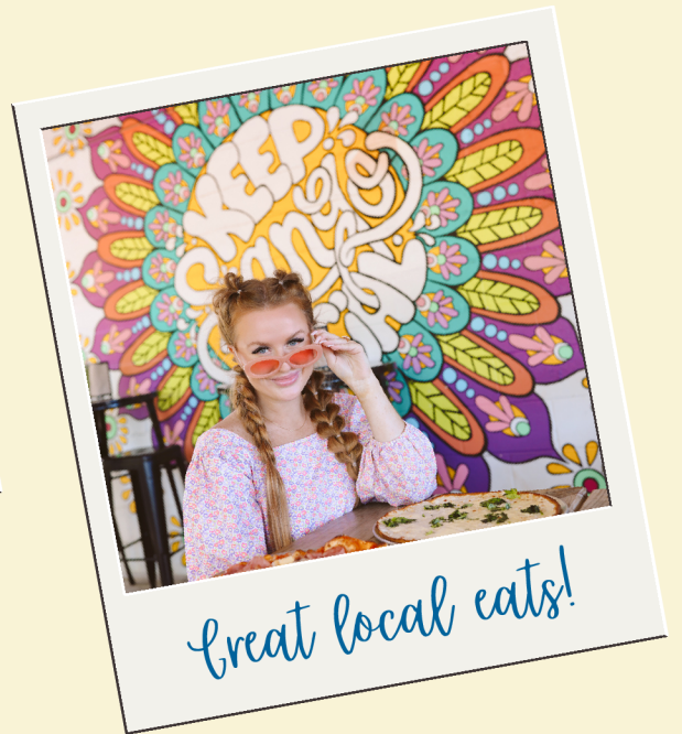
Great local eats!