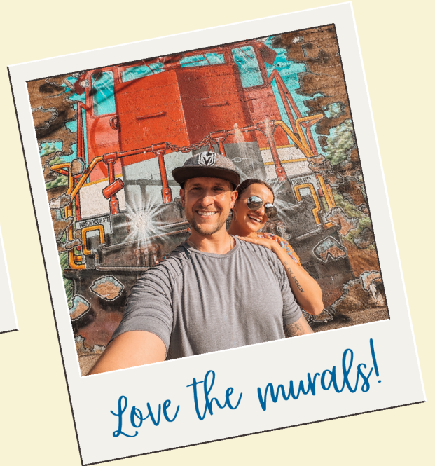
Love the murals!