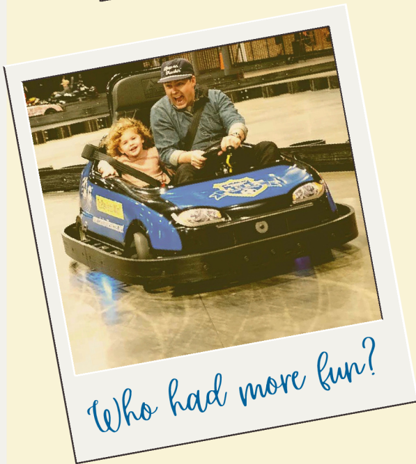
Who had more fun?