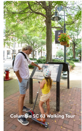
Columbia SC 63 Walking Tour

Commemorating the year 1963—the height of the American Civil Rights Movement—the Columbia SC 63 Walking Tour highlights important sites in Columbia where pivotal moments occurred in the fight for human rights, as ordinary citizens and community leaders joined forces to challenge segregation and injustice. Hop on a bus and tour African American sites with Historic Columbia . Comprised of several sites listed on the National Register of Historic Places, this tour features locations that illustrate important events and little-known facts about Columbia's African American community. Or tour the historic Harriet Barber House , built in 1880 by freed slaves who purchased the land in 1872. The Barber House is a part of the Lower Richland Heritage Corridor , which offers guided tours.