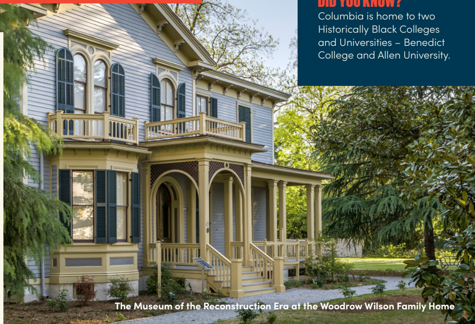
The Museum of the Reconstruction Era at the Woodrow Wilson Family Home

Curated with the assistance of Historic Columbia, highlights eight locations and 10 trailblazers of the post-Civil War period to provide a new perspective to residents and visitors on how the past has shaped our modern nation. Through this tour, you will explore the history of the places and people significant to Reconstruction, while also becoming familiar with the advancements made by Black citizens prior to their rights being revoked under Jim Crow. Visitors and residents can pick up a copy of the trail guide at the Columbia SC Visitor's Center, Historic Columbia's Gift Shop at Robert Mills or learn more by visiting reconstructedcolumbiasc.com .