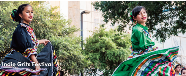
Indie Grits Festival

Columbia is home to two Historically Black Colleges and Universities – Benedict College and Allen University.