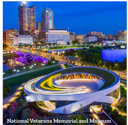
National Veterans Memorial and Museum