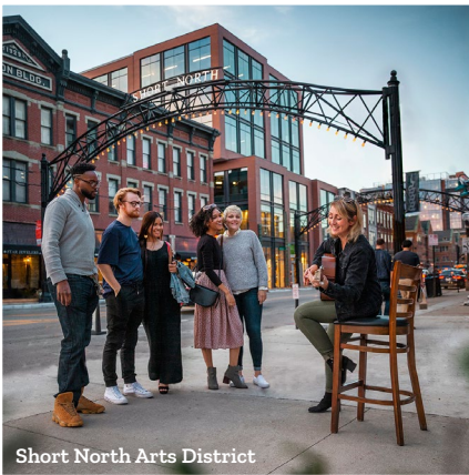
Short North Arts District