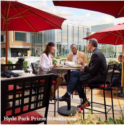
Hyde Park Prime Steakhouse

Creative. Smart. Inclusive. Effervescent.