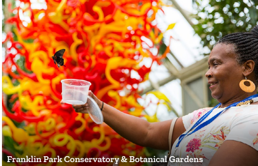
Franklin Park Conservatory & Botanical Gardens