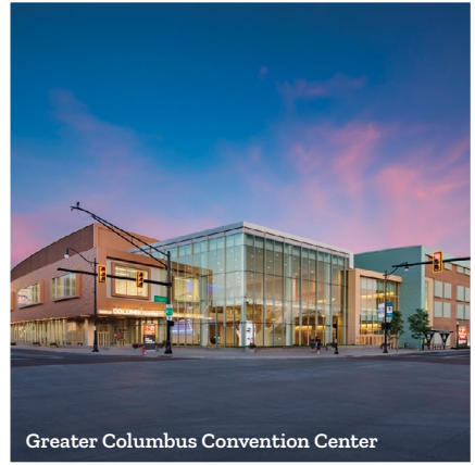
Greater Columbus Convention Center

More than 100 unique restaurants are located within one mile of the center