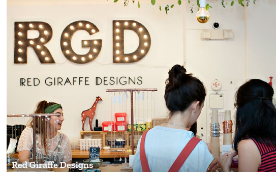
Red Giraffe Designs