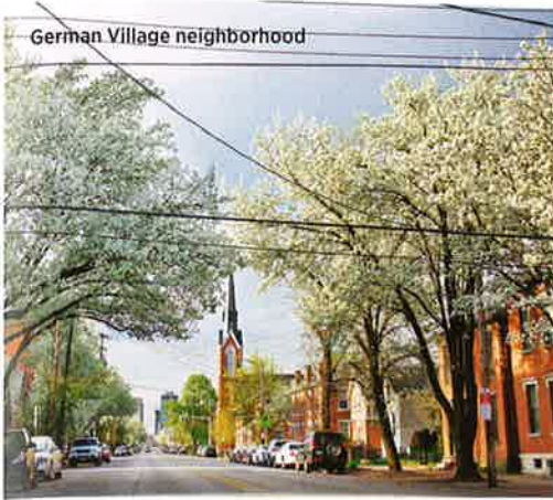
German Village neighborhood