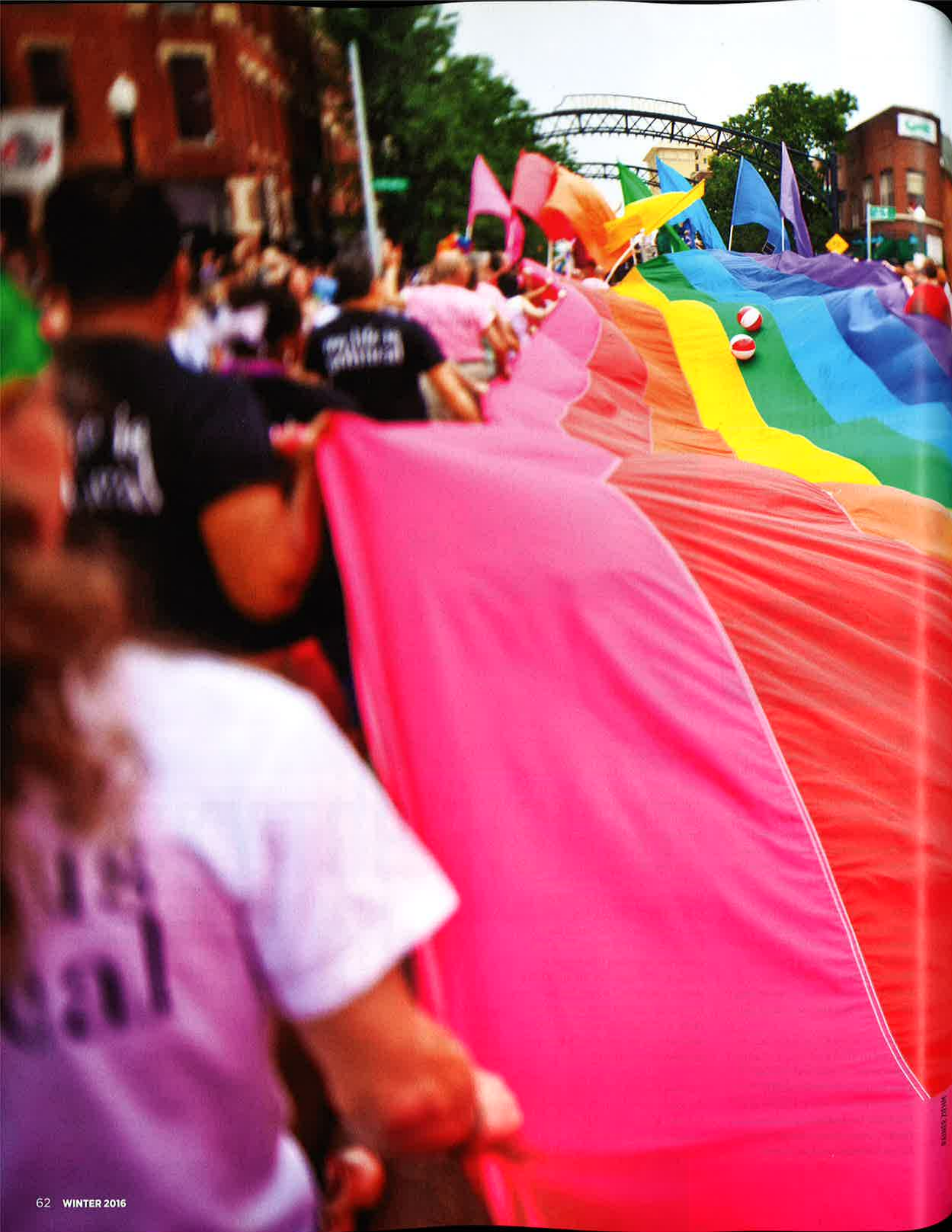
A giant rainbow flag is part of the annual Columbus Pride parade.