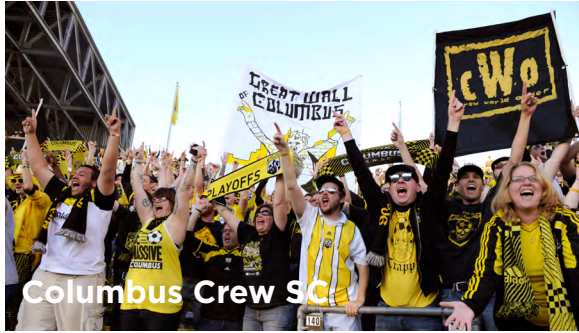
Columbus Crew SC