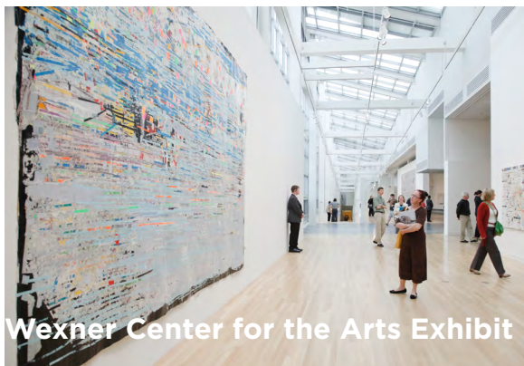
Wexner Center for the Arts Exhibit

The events calendar is the most popular section of experiencecolumbus.com . Make sure your event is listed so that it can be found by visitors.