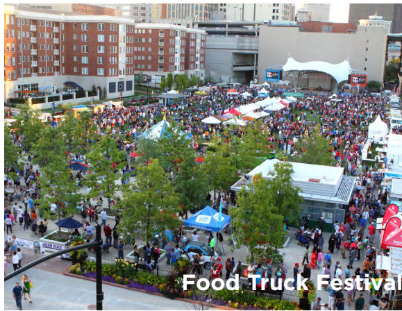
Food Truck Festival