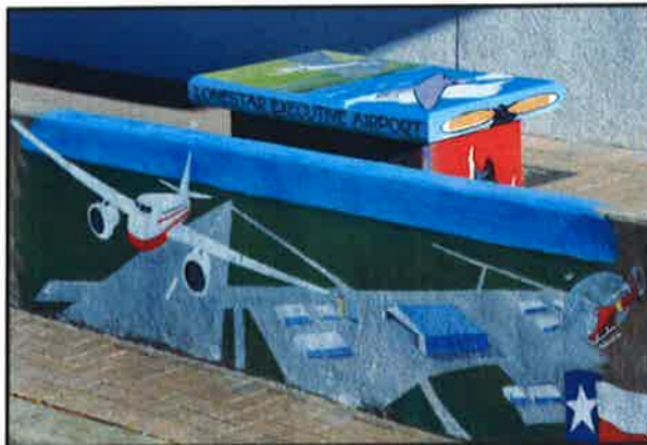
13. Airport the Conroe airport has evolved since its role during World War II. Presently, the Conroe/North Houston Regional Airport hosts two FBOs, a restaurant, an Army Reserve Aviation Unit,