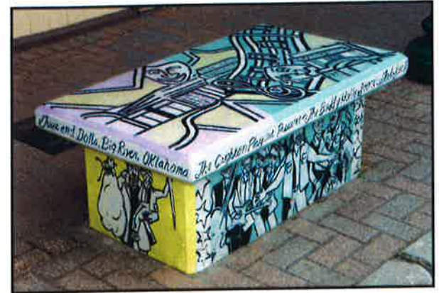
8. Crighton Players honors the original theatre group that was founded in 1967 to produce theatrical performances at the Historic Crighton Theatre. Created by Lynn Peverill.