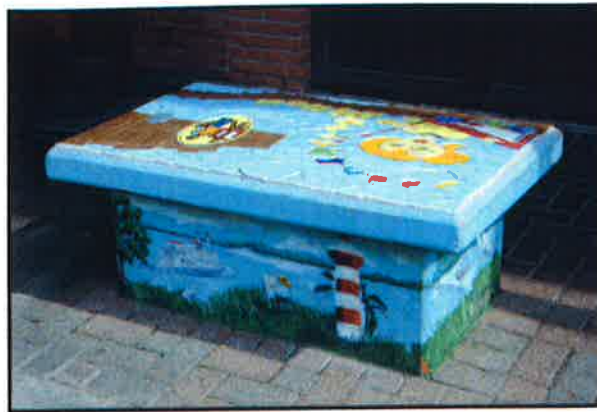
6. The Visual Arts- on Track honors the impact of the Art League in the community. Created by artists of the Conroe Art League in ceramic, glass tiles and paint.