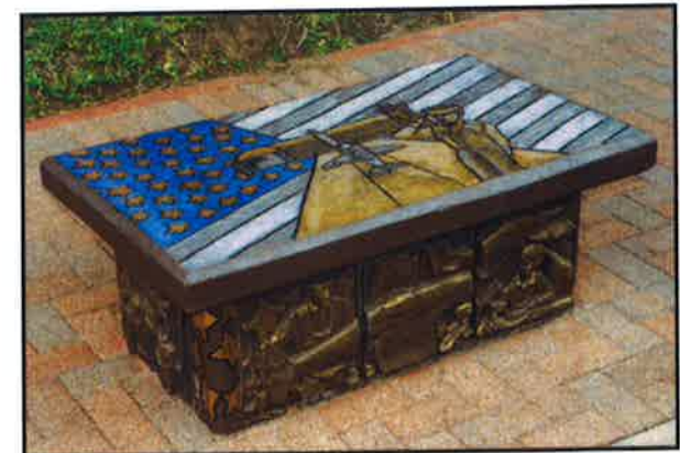
10. World War II is a tribute to the people who staffed the Conroe naval base constructed in 1939 by the Civil Aeronautics Authority to