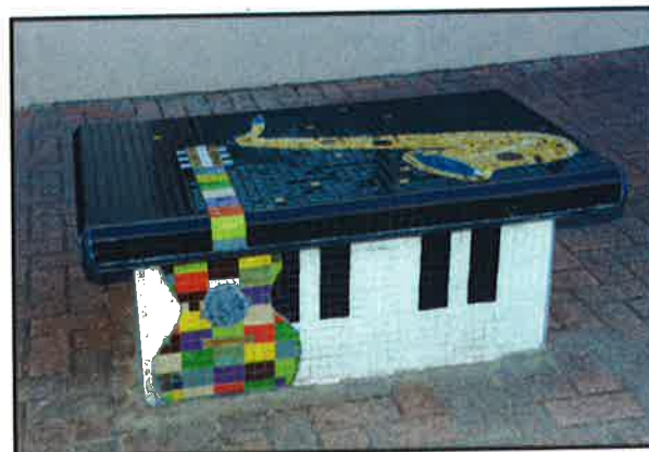
3. Boogie Bench is a tribute to local music history in Conroe. Many professional musical performances contribute annually through the