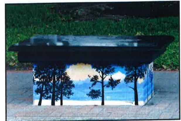
9. History in Brief celebrates Conroe's earliest industrial businesses of lumber and oil. During the 1930's, Conroe had more millionaires per capita than any other US city. The top was laser etched and sides were painted by Joe Davenport