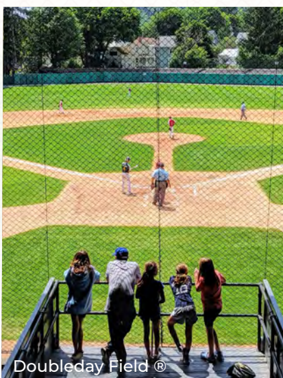
Doubleday Field ©