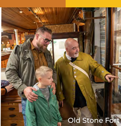
Old Stone Fort