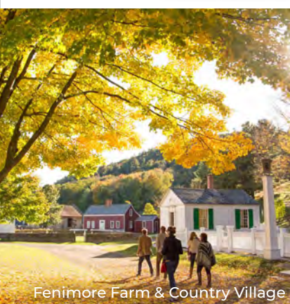
Fenimore Farm & Country Village