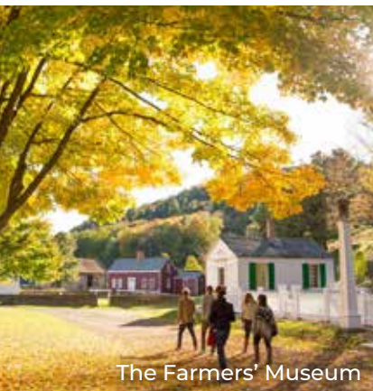
The Farmers' Museum