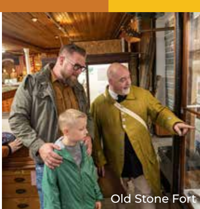
Old Stone Fort