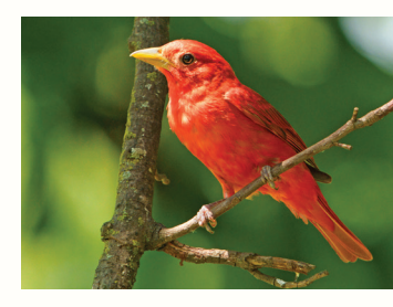
Species Checklist • 13

A male songbird with a vibrant, all-red plumage. Females are rare, and bright yellow-green with a short pale bill. Both have a chuckling call note.