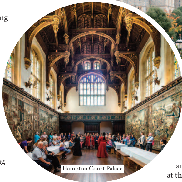
Hampton Court Palace

Arrive in London and consider exploring somewhere away from the popular tourist attractions. There's the London Wetland Centre with 105 acres of award-winning nature and wetland reserve – a safe haven for a wide range of wildlife. At Hyde Park Corner you'll find English Heritage's Apsley House , the former home of Arthur Wellesley, 1st Duke of Wellington and Wellington Arch a victory arch proclaiming Wellington's defeat of Napoleon. Time your visit to view the Household Cavalry riding under the arch to and from the Changing of the Guard at Horse Guards Parade.