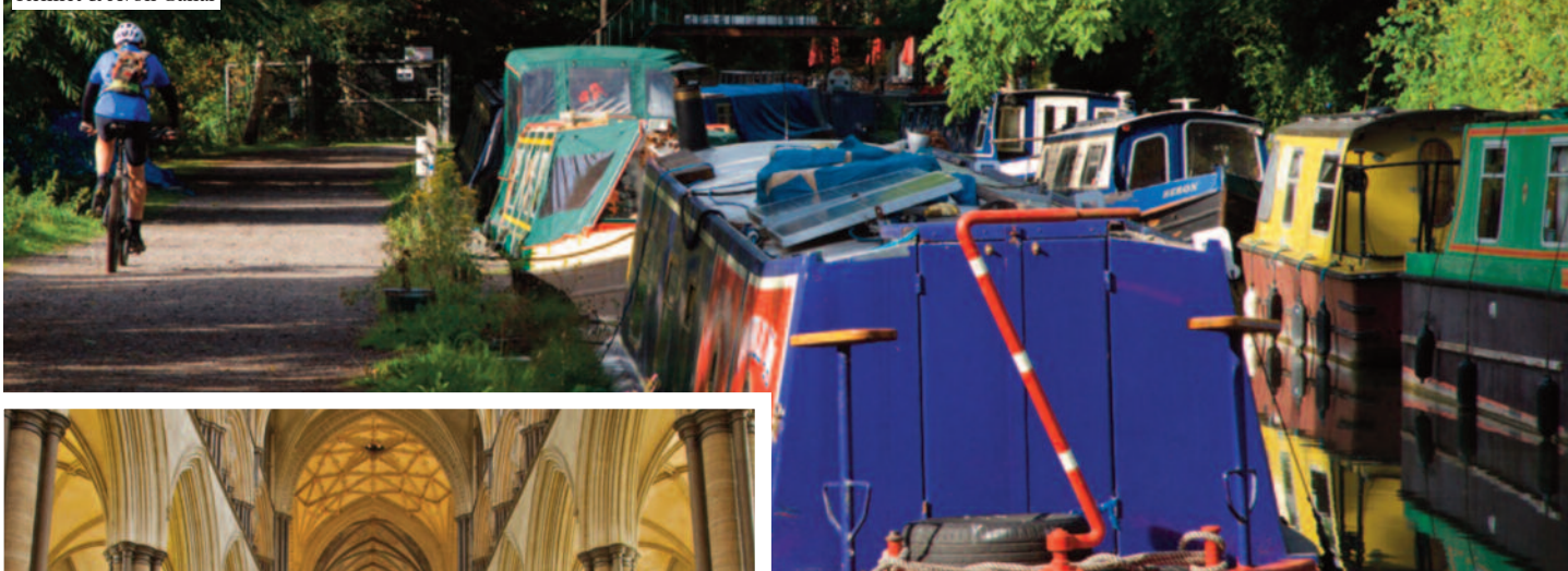
Kennet & Avon Canal

Stop for lunch at White Horse Inn , Calne, Honeystreet Boats & Café , Pewsey, or in Hungerford Cobbs Farm Shop & Kitchen or The Tutti Pole .