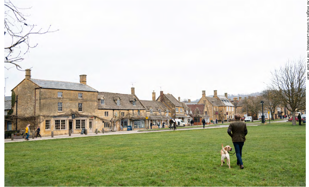
All images © Emma Lathwood, The Picture Taker