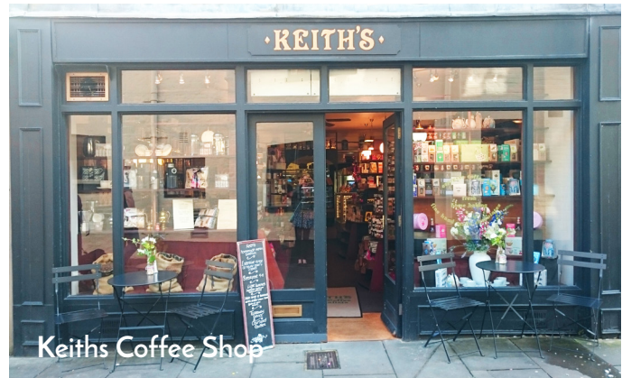
Keiths Coffee Shop

Numerous venues in Cirencester offer beautiful outdoor spaces, where you can relax and enjoy your gastronomic journey, whilst taking in the delights of the beautiful town. Many of the town eateries source food and meats locally, so eating in Cirencester really is getting a taste of the Cotswolds.