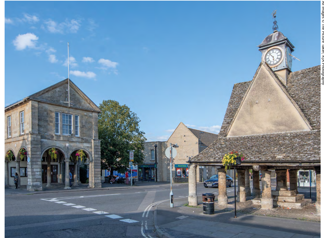
All images © The Picture Taker; RJA photography