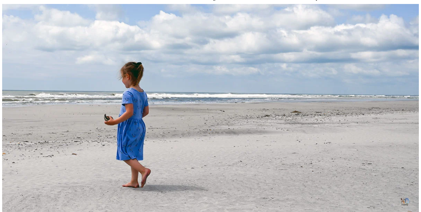
Bear Island in Hammocks Beach State Park (How to Reach It and 10 Fun Things to Do!)