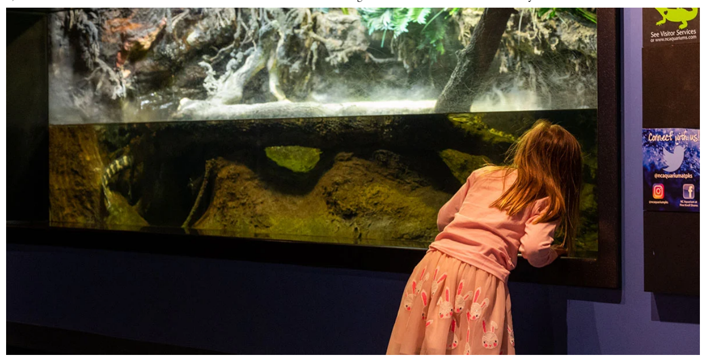
NC Aquarium at Pine Knoll Shores (5 Important Tips to Enjoy!)