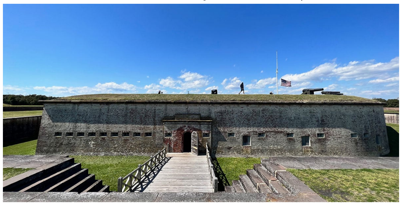
Fort Macon State Park (Interesting Facts and 7+ Things to Do!)