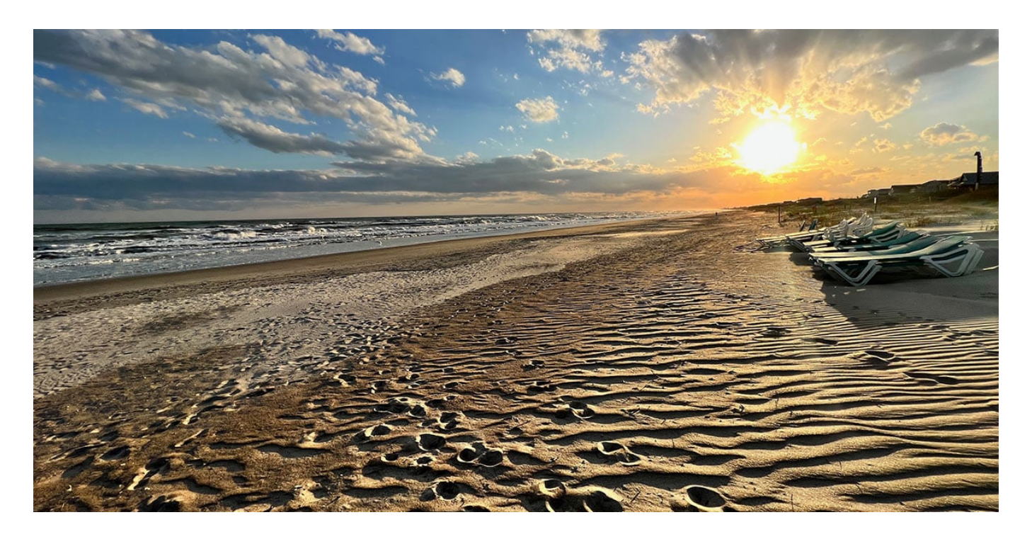
20 Fun Things to Do in Atlantic Beach and Nearby!