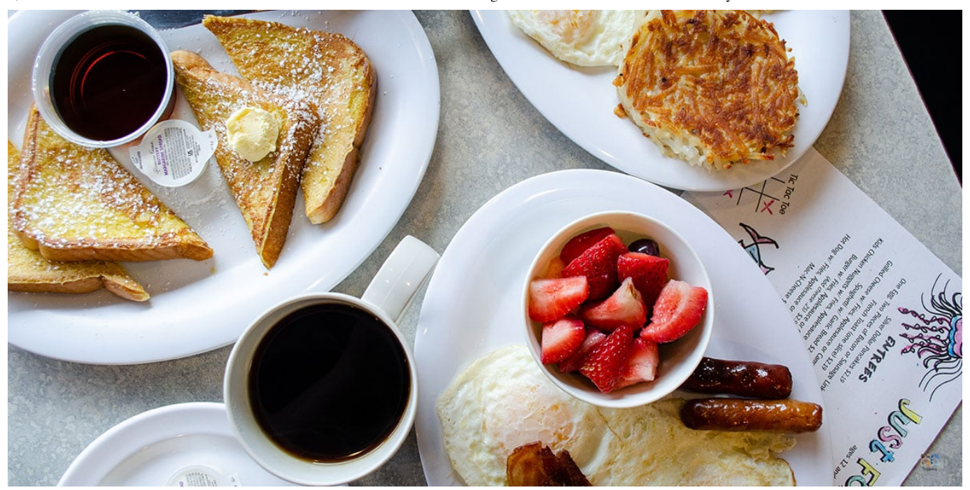
20 Amazing Restaurants in Jacksonville, NC (+ Onslow County)