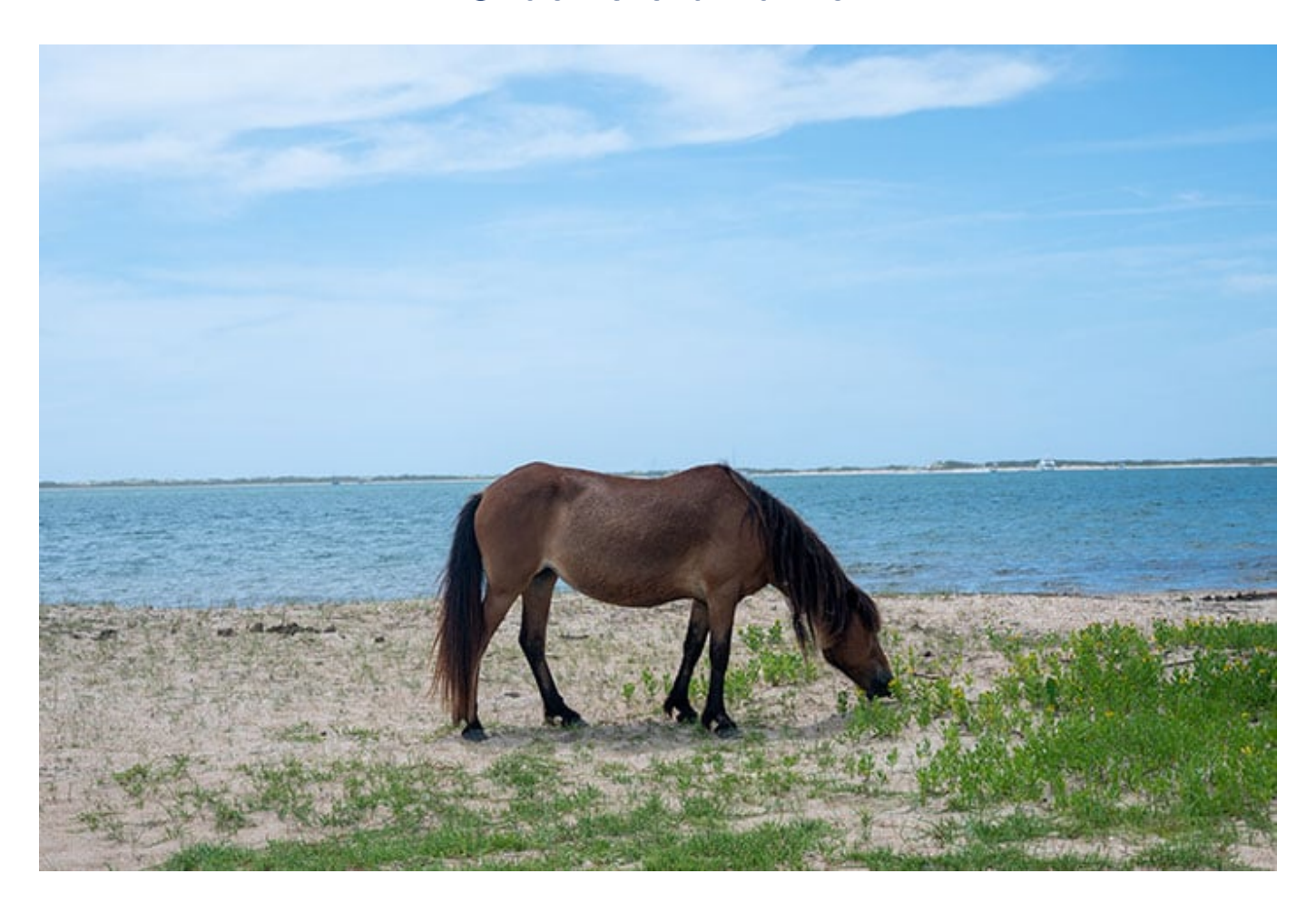
Remain 50 feet away from the wild horses (this was taken with a zoom lens)

Many of the ferries to Cape Lookout also stop at Shackleford Banks, home to North Carolina's wild horses. Visitors can see the horses (from a safe distance) while on the island.