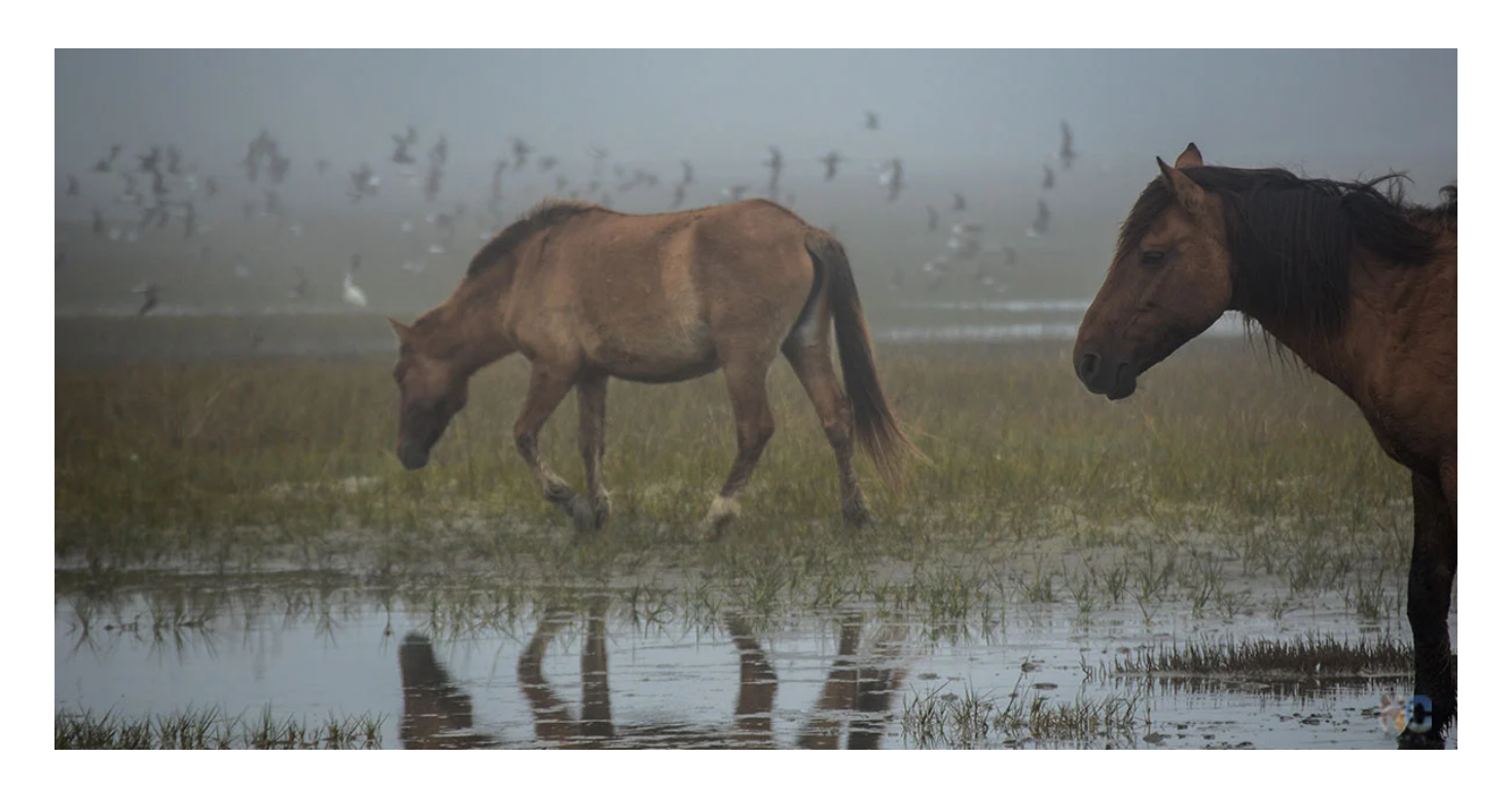
The Rachel Carson Reserve in Beaufort (Wild Horses and 4 More Things To Do!)