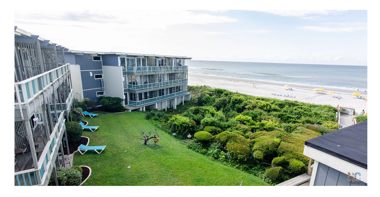
Atlantis Lodge in Atlantic Beach (10 Things We Love!)