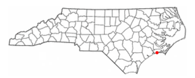
Map by Seth Ilys at English Wikipedia. CC-BY SA 3.0 via Wikimedia Commons.

Emerald Isle, North Carolina is in Carteret County and is part of a collection of beaches known as the Crystal Coast. The Crystal Coast is a stretch of barrier islands running from Cape Lookout National Seashore to Emerald Isle.