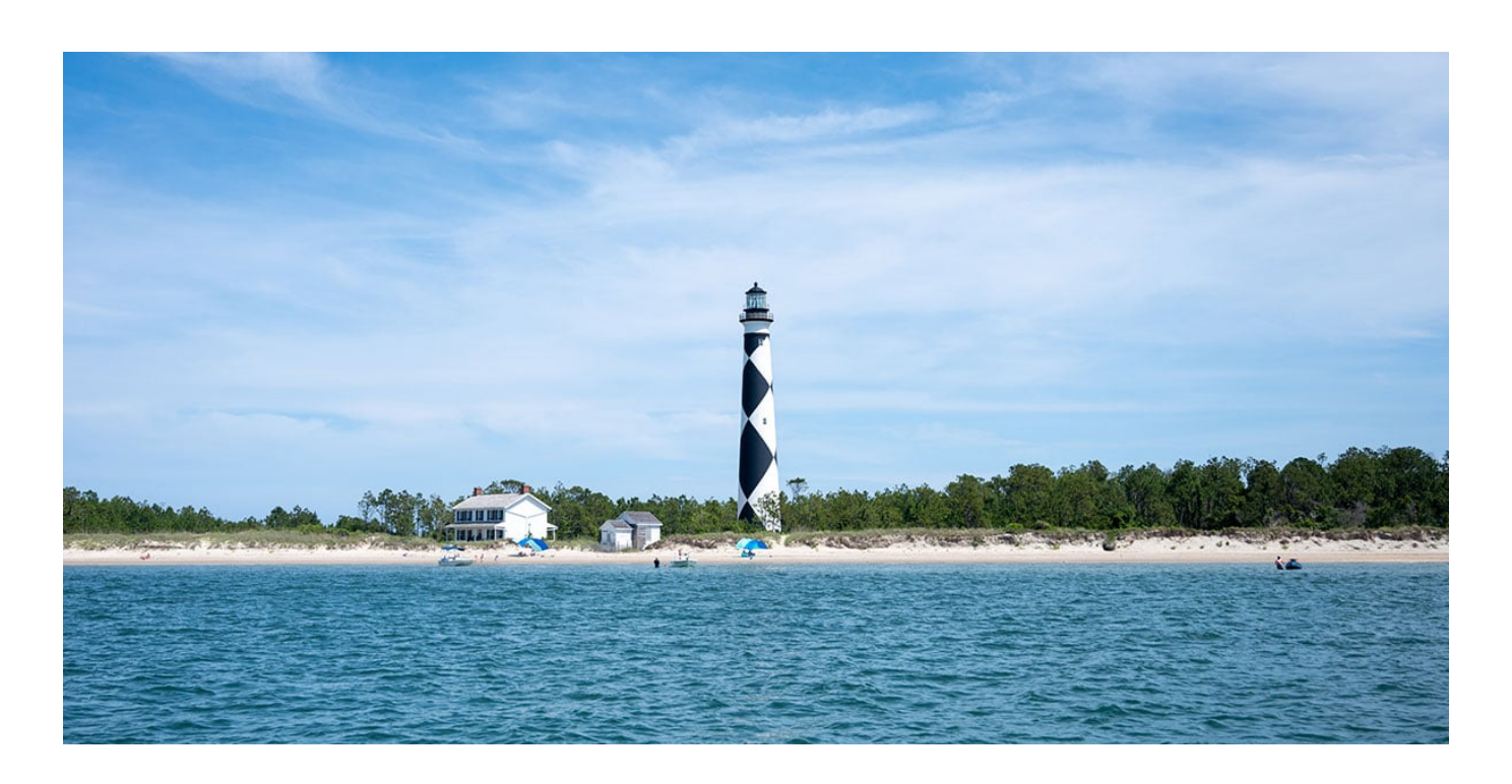
Cape Lookout National Seashore (How to Get There + the 10 Best Things to Do!)