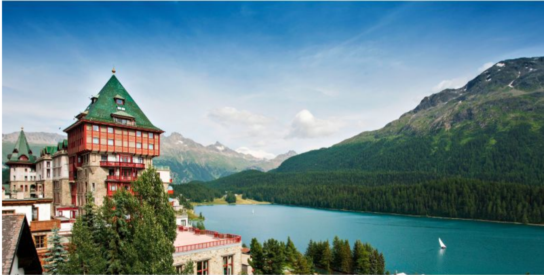
Badrutt's St. Moritz