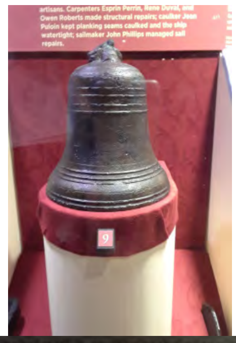
Queen Anne's Revenge items on display at the museum range from small personal objects to a heavy bell and a cannon.

OCRACOKE, N.C. – Say "Blackbeard" and what comes to mind may be a blood-thirsty pirate so unhinged that he tied firecrackers to his facial hair and lit them for yucks.