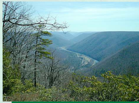
Hemlock Mountain Vista—Tiadaghton State Forest

Many of the best hunting grounds, finest fishing streams, and grandest views in Pennsylvania are found throughout our state forests.