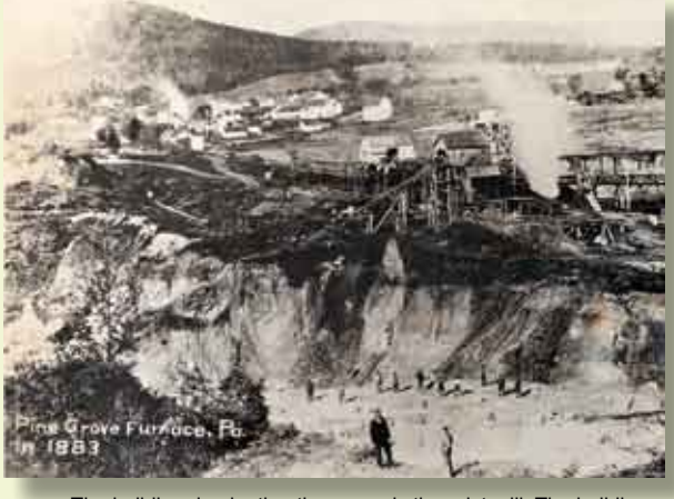
The building dominating the scene is the grist mill. The buildings in the upper left are the iron works. The men standing below the cliffs are standing in the rock quarry that is now Fuller Lake.

But, new technologies were quickly putting small iron producers out of business. Pine Grove Furnace went out of blast in 1895, ending 131 years of iron making on South Mountain.