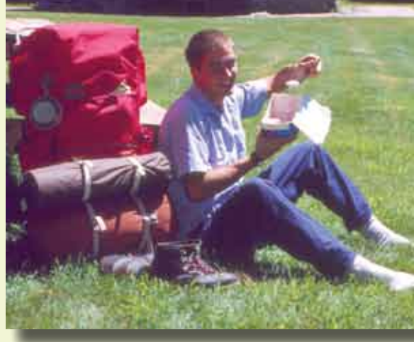
A thru-hiker eats the traditional ice cream at Pine Grove Furnace State Park, the halfway point of the Appalachian Trail.