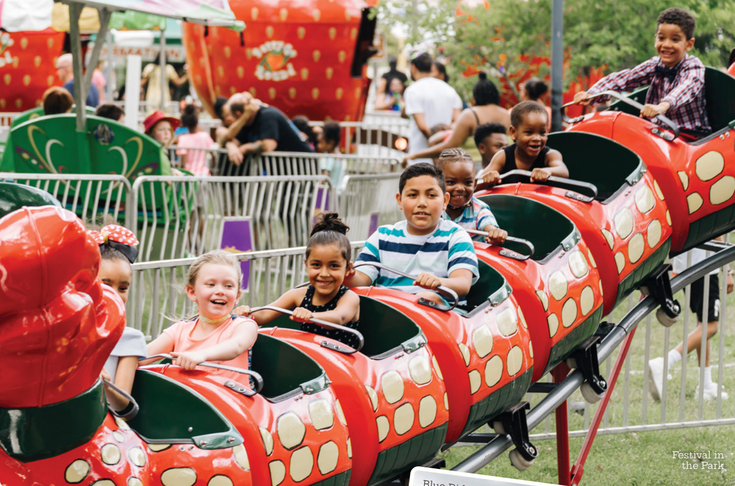
Festival in the Park

Gretna's Strawberry and Wine Festival is all you can ask for in a gorgeous spring setting, with live music, local wineries and, of course, thousands of strawberries! (May; 19783 US-29 Chatham, VA 24531, gretnastrawberrywinefest.com , gretnasandwfest@google.com )