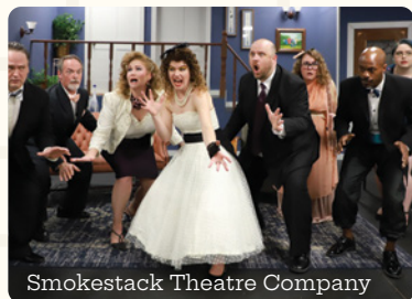
Smokestack Theatre Company

Smokestack Theatre Company is a nonprofit organization serving Danville, Pittsylvania County and the surrounding region. Their theatre artist ensemble is dedicated to creating quality, exciting and transformative theatre for the cultural enrichment of the entire community. They strive to enhance our community through education and outreach to adults and children, providing innovative instruction and creative expression to inspire another generation of theatre artists. 319 Lynn Street, Danville, VA 24541, (434) 549-5445, thesmokestack.org