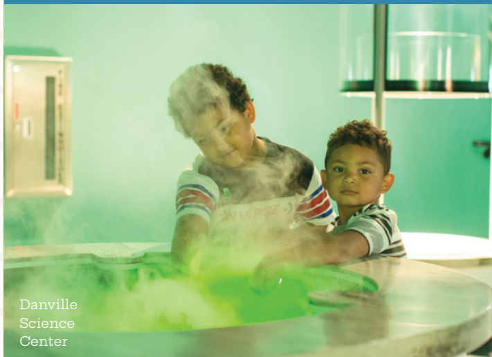
Danville Science Center

The Danville Science Center has been the region's educational and cultural anchor since 1995. Over 50,000 guests each year are able to explore STEM concepts and skills thanks to interactive exhibits, hands-on activities, live demos, touring exhibitions, special events and incredible Digital Dome Theater presentations. The Danville Science Center is a part of Richmond's Science Museum of Virginia , inspiring Virginians to enrich their lives through science.