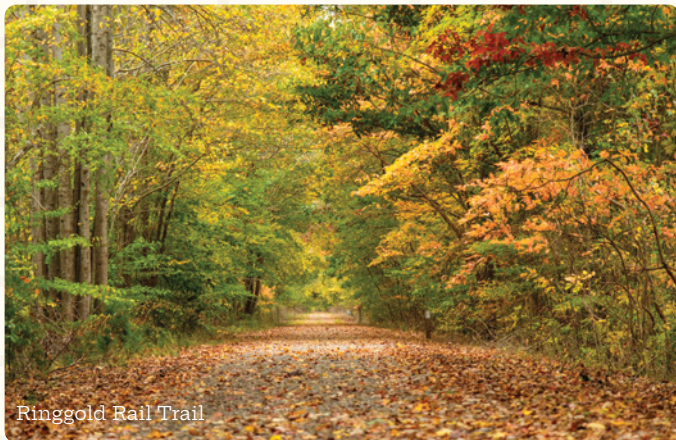
Ringgold Rail Trail

Anglers Ridge Association: anglersridgetrails.org