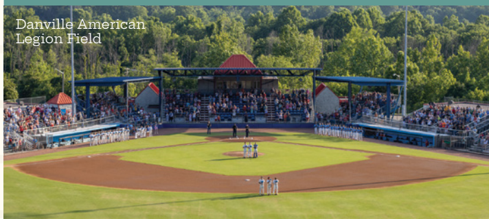
Danville American Legion Field

Take your family out to the ballgame at Danville American Legion Post 325 Field! A new era of baseball and entertainment for Danville and the Southside is here, thanks to the Danville Otterbots . The Appalachian League professional sports team provides summer fun for all, and is a great way to enjoy America's favorite national pastime. A fun fact, Scotter the Otter, the Danville Otterbots mascot, is a tribute to racing legend, Wendell Scott. In 2021, the Otterbots retired the number 34 jersey to honor Scott's iconic No. 34 racecar. Designed by the same designer of the mascot for the NASCAR Hall of Fame, the rest of Scotter's ensemble is racing inspired with a racing helmet, gloves and boots!