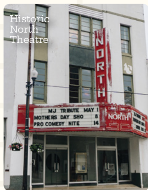
Historic North Theatre

complete $3.5 million restoration. 629 N Main Street, Danville, VA 24540