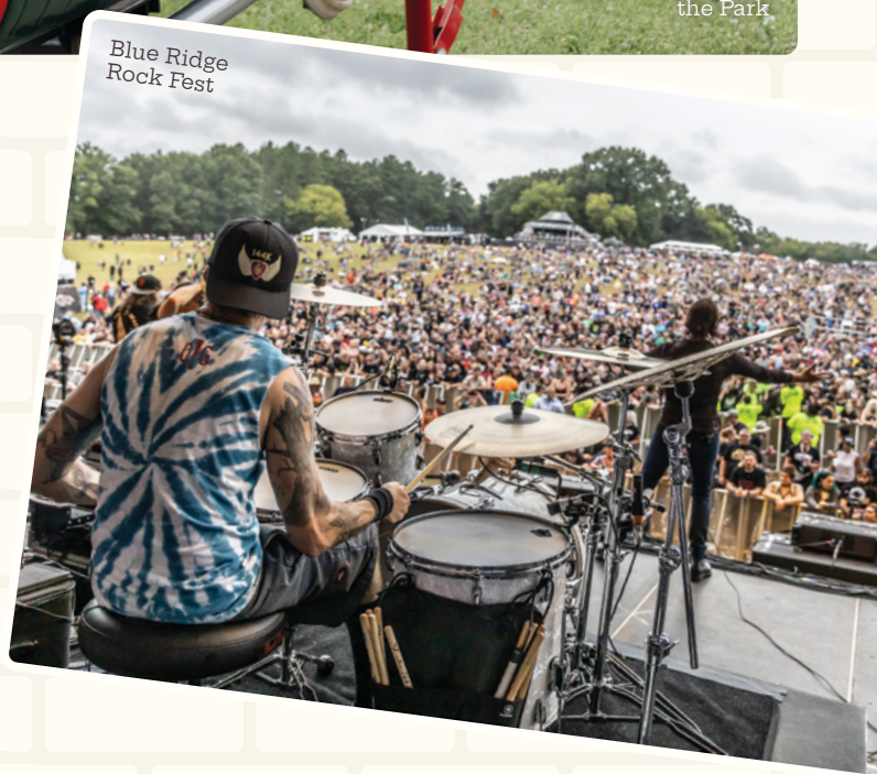
Blue Ridge Rock Fest