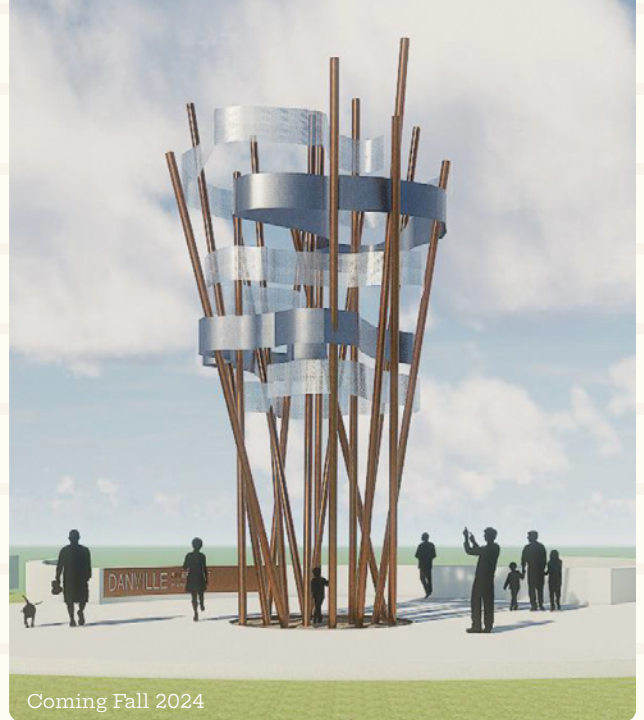
Coming Fall 2024

855-633-8238, caesars.com/caesars-virginia