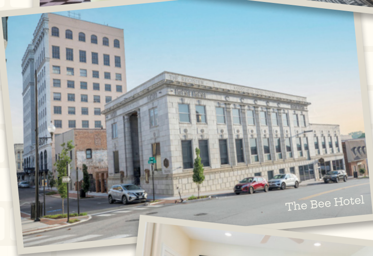
The Bee Hotel