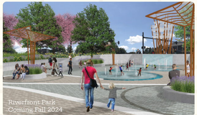
Riverfront Park Coming Fall 2024