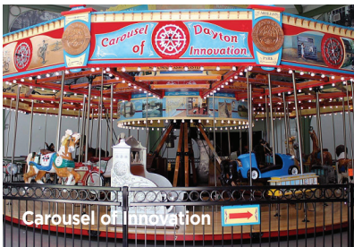
Carousel of Innovation