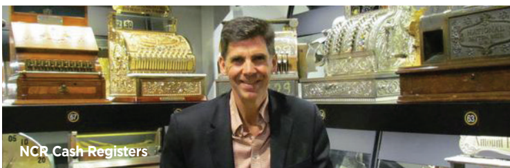
NCR Cash Registers