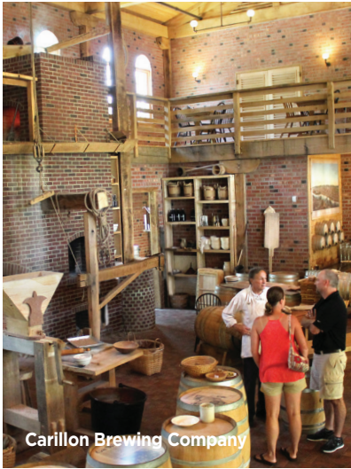
Carillon Brewing Company