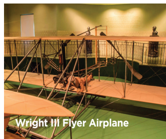
Wright III Flyer Airplane