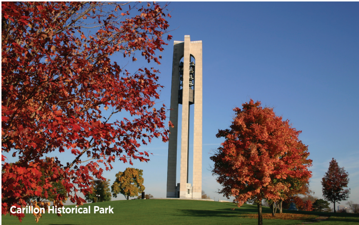
Carillon Historical Park

Inventions from Dayton have literally changed the world! In fact, at the turn of the 20th century, Dayton had more patents per capita than any other city in the nation and one-sixth of the nation's corporate executives had spent a portion of their career at legendary Dayton company, National Cash Register (NCR). The airplane. The self-starting ignition for the automobile. The ice-cube tray, and pop-top can. Yep, they were invented in Dayton. Visit Dayton and catch our innovative spirit!