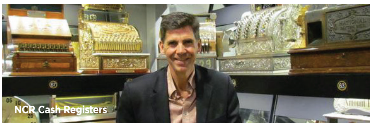
NCR Cash Registers