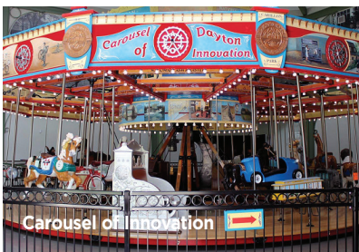
Carousel of Innovation