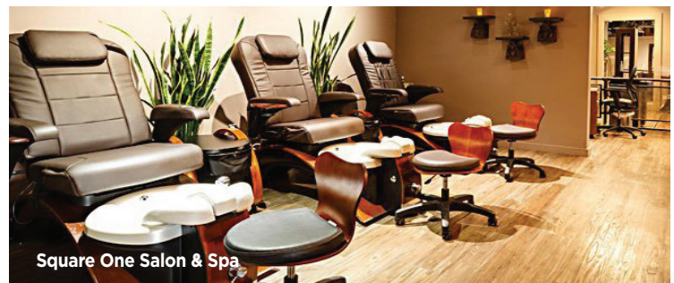
Square One Salon &amp; Spa