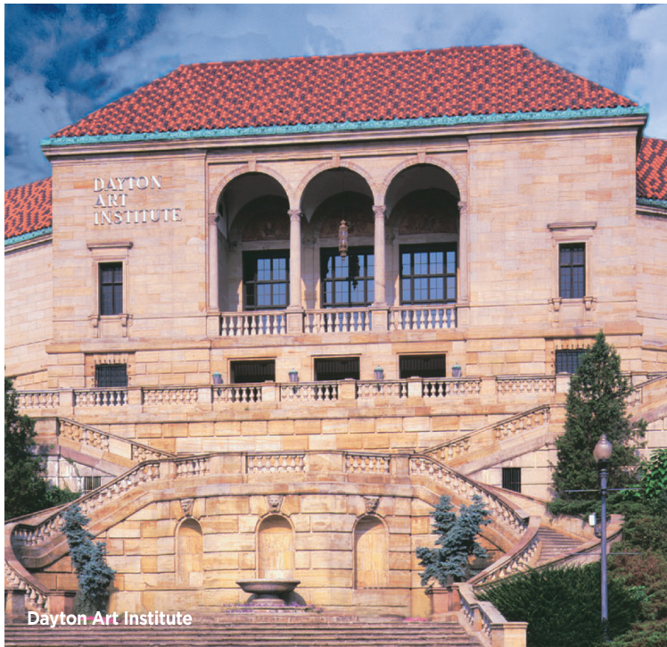
Dayton Art Institute

Get your "art on" at the stunning Dayton Art Institute , one of the Midwest's premier fine arts museums. Marvel at Monet, be dazzled by Degas and wowed by Warhol. Pick up a treasure at the Museum Store . 456 Belmonte Park North, 937-223-4278