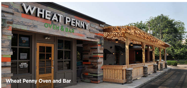
Wheat Penny Oven and Bar