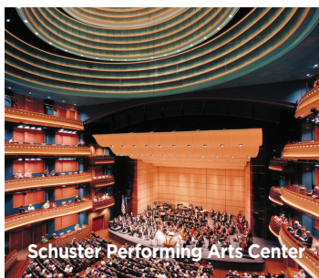
Schuster Performing Arts Center