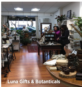
Luna Gifts &amp; Botanicals