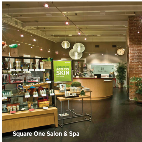
Square One Salon &amp; Spa