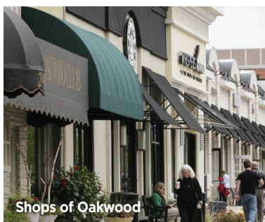
Shops of Oakwood