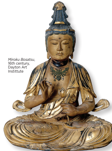
Miroku Bosatsu, 16th century, Dayton Art Institute

Get your "art on" at the stunning Dayton Art Institute , one of the Midwest's premier fine arts museums. Marvel at Monet, be dazzled by Degas and wowed by Warhol. Pick up a treasure at the Museum Store . 456 Belmonte Park North, 937-223-4278