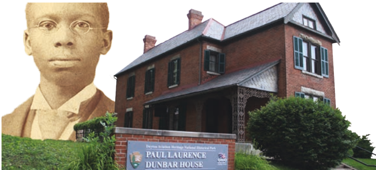
Dunbar-Laurence National Historical Park PAUL LAURENCE DUNBAR HOUSE