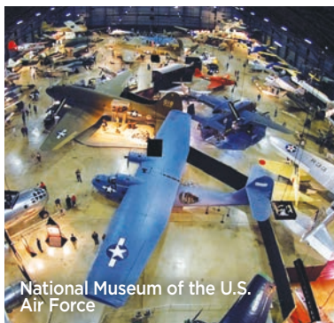
National Museum of the U.S. Air Force