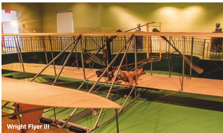
Wright Flyer III

BONUS! Have your passport stamped at 8 of 17 aviation sites and get your very own Wilbear Wright Aviator Teddy Bear! Download a Passport at daytoncvb.com