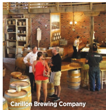
Carillon Brewing Company