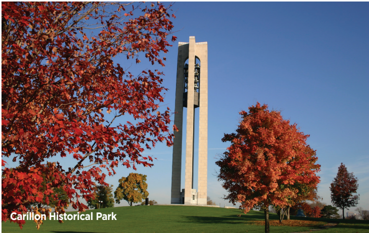
Carillon Historical Park