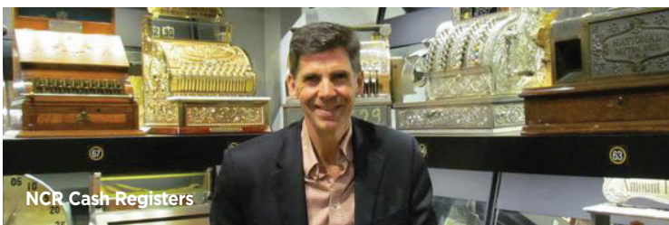
NCR Cash Registers