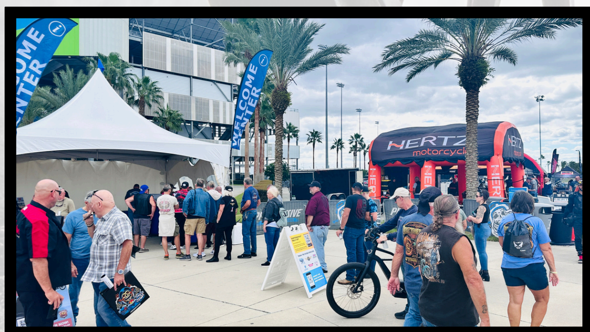
Welcome Center Tent located at the Daytona International Speedway