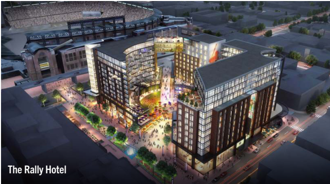
The Rally Hotel