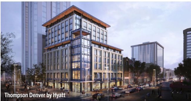
Thompson Denver by Hyatt