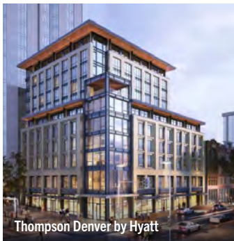
Thompson Denver by Hyatt