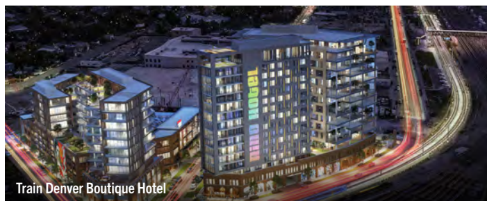
Train Denver Boutique Hotel