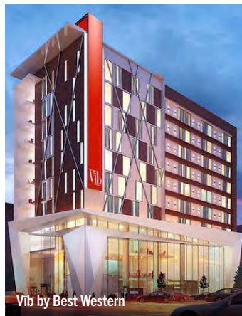
Vib by Best Western