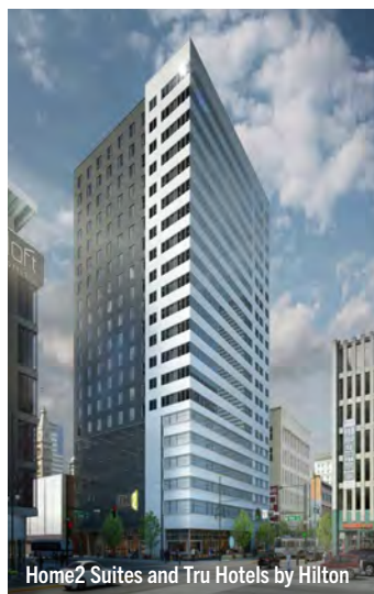
Home2 Suites and Tru Hotels by Hilton

The hotel business is booming in Denver. The downtown area is home to more than 11,000 rooms within a short walking distance of the Colorado Convention Center. There are also more than 50,000 first-class hotel rooms in the greater metro area.