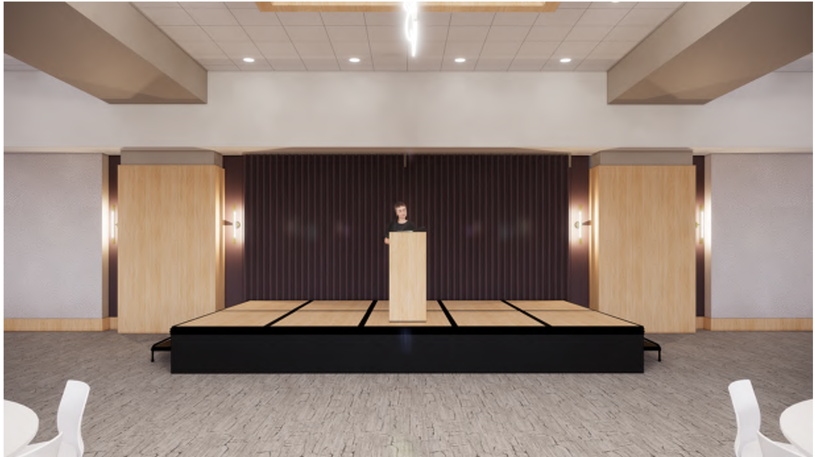
BALLROOM Speaker Forum Set-up