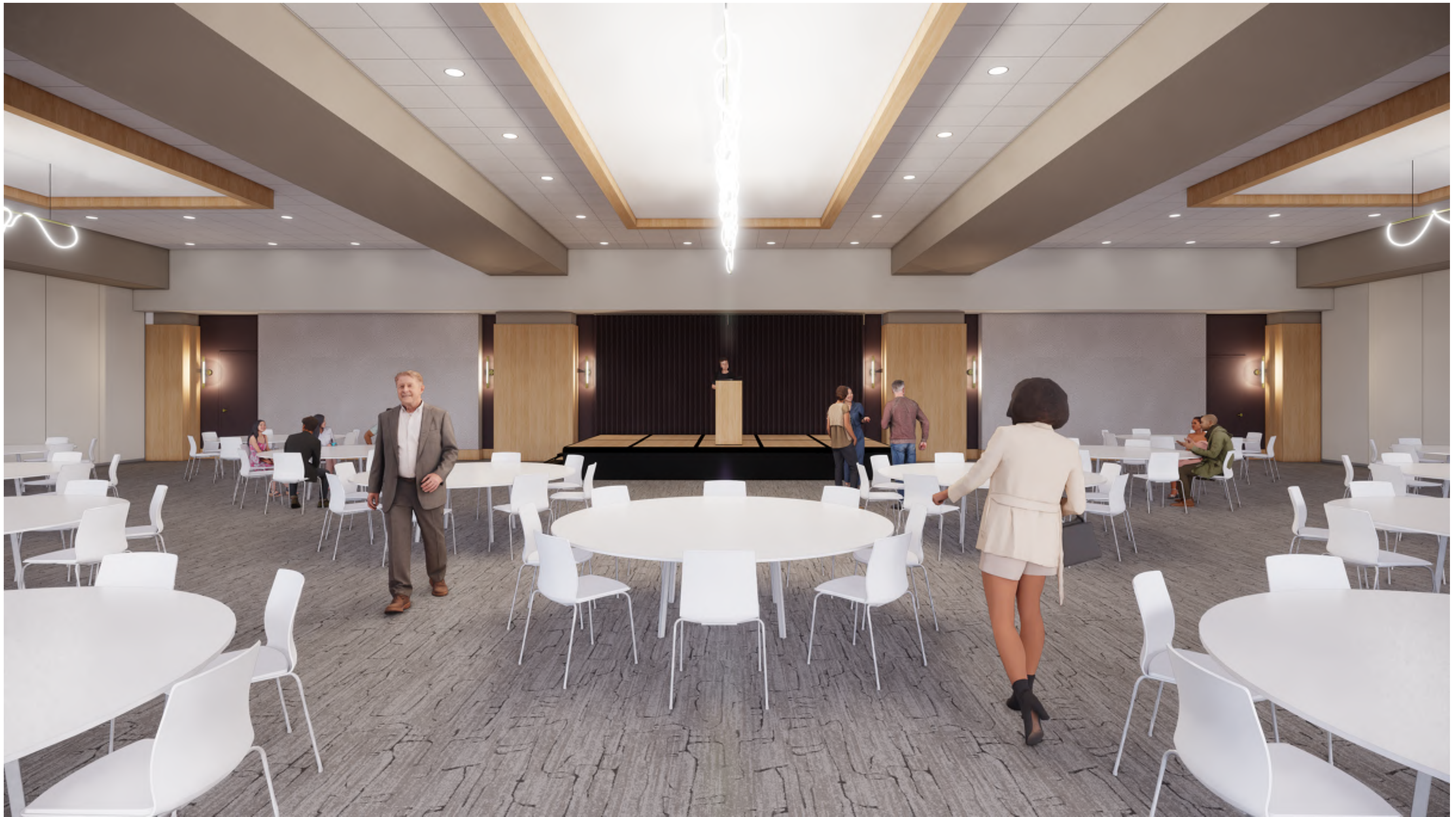
BALLROOM Speaker Forum Set-up