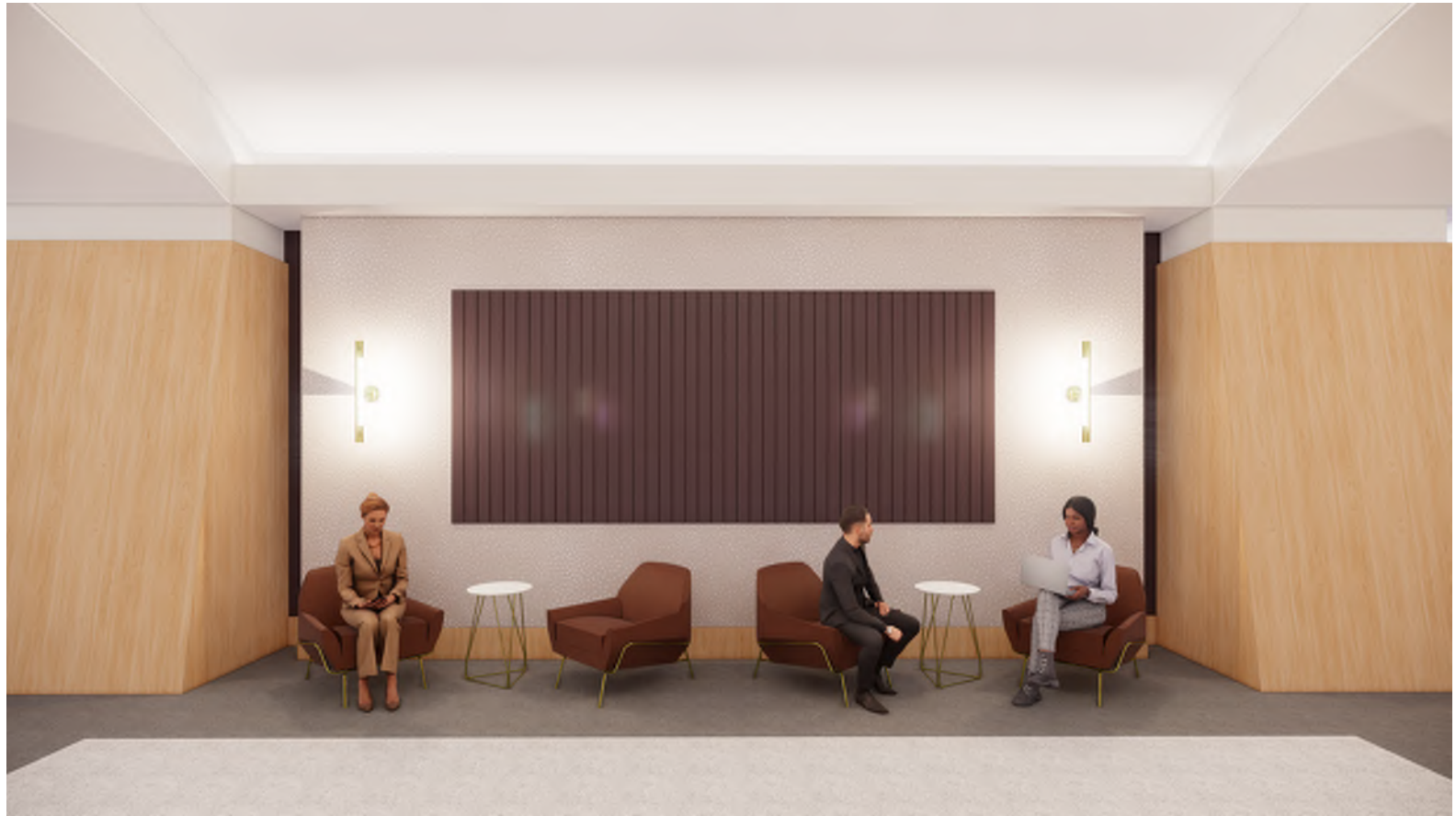
PRE-FUNCTION Looking East