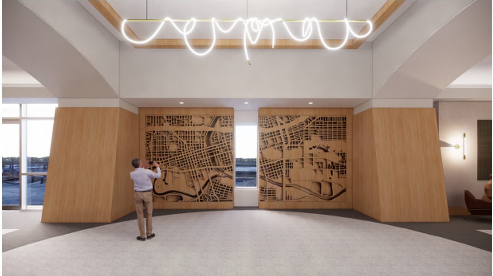
PRE-FUNCTION Looking East