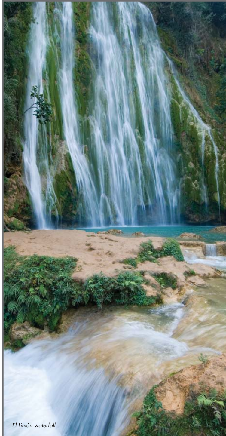
El Limón waterfall