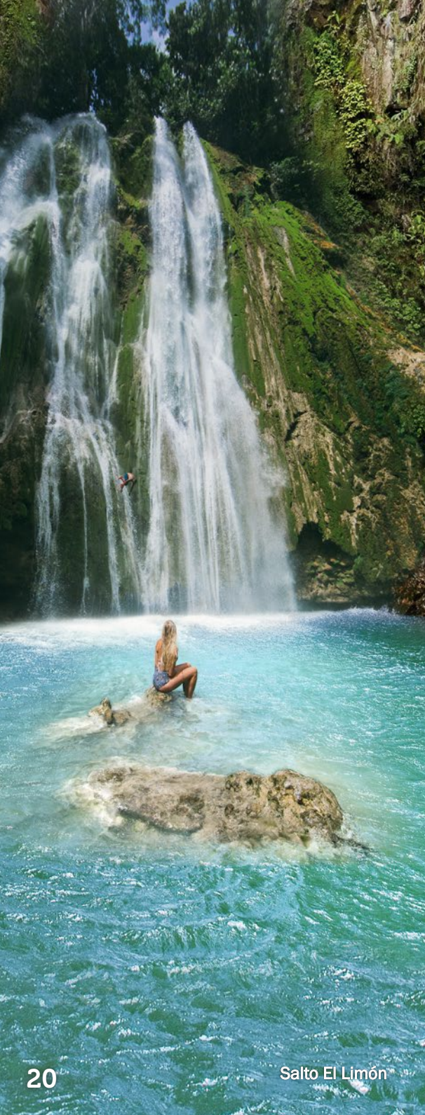
Salto El Limón