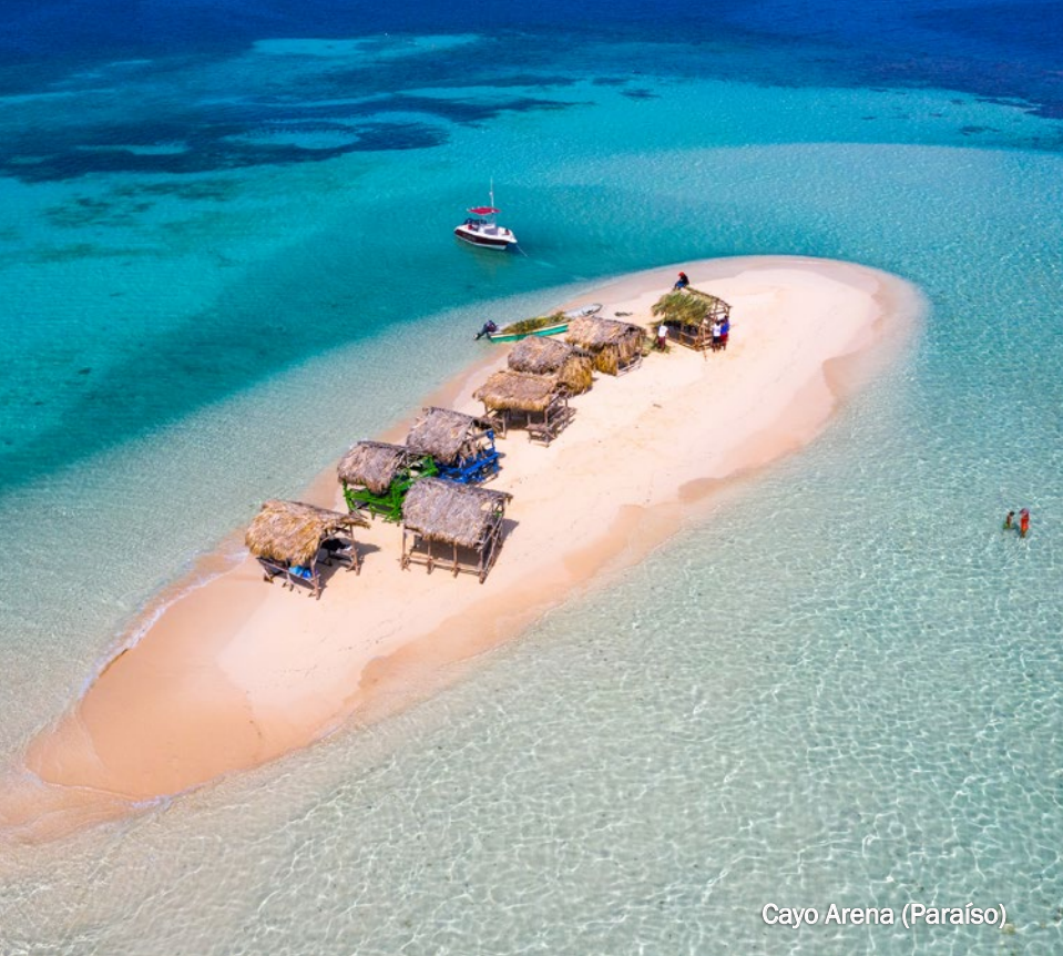
Cayo Arena (Paraíso)