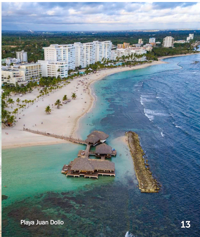
Playa Juan Dolio