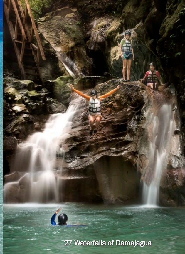
27 Waterfalls of Damajagua

MOUNT ISABEL DE TORRES: Get engaged in the heavens, or at least pretty close, while taking a suspended cable car 2,565 feet (781 meters) up to the top of Mount Isabel de Torres at the foot of the shores of Puerto Plata. Enjoy the magnificent views of the Atlantic Ocean while a statue of Christ the Redeemer awaits at the top, surrounded by beautiful gardens.