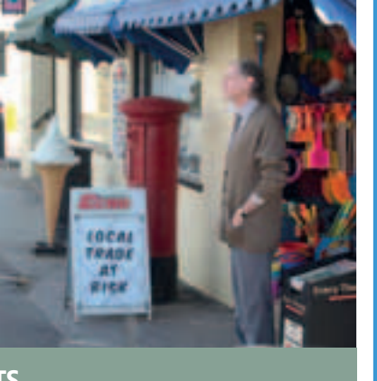
this newsagents was used as Jack sagents in the first series.