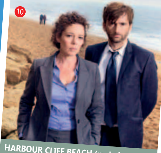
HARBOUR CLIFF BEACH (main image) Easily recognisable as the stunning setting of the beach where Danny's body was found in the opening episode of the first series. The towering sandstone cliffs and beach are so symbolic to Broadchurch and feature prominently throughout both series.