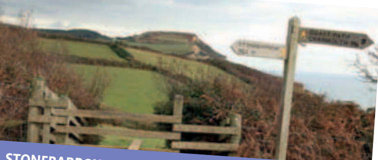
STONEBARROW (nr CHARMOUTH)