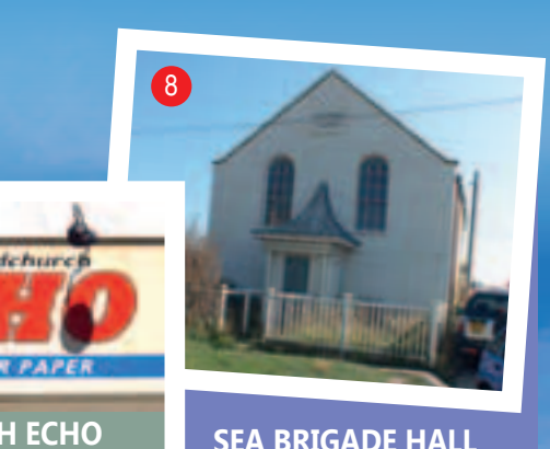
SEA BRIGADE HALL

The old Methodist Church near the entrance to East Beach was dressed and used as the exterior for the Sea Brigade Hall in the first series.