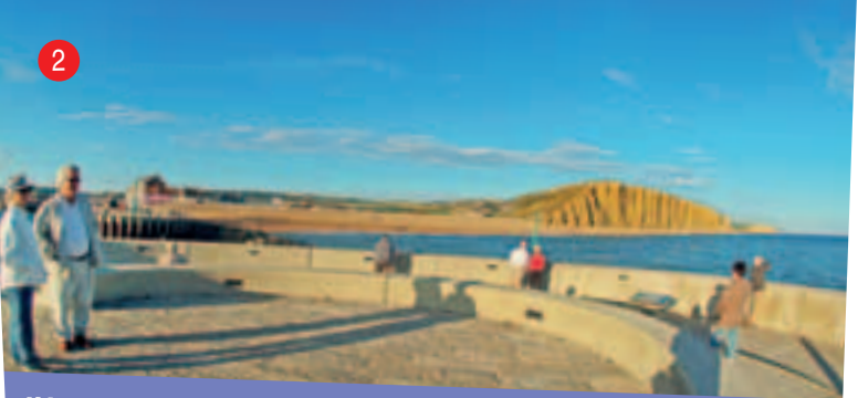
JURASSIC PIER AND HARBOUR

Many scenes were shot from this cliff and it provides magnificent views across West Bay. Take a walk up the cliff and soak up the vista!