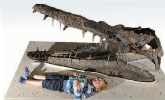
Pliosaur at Dorset County Museum

Meet Dorset's real dinosaurs as you uncover the past from Prehistoric to Roman times and explore the lives and works of Dorset's literary greats. This unique building on High West Street has a splendid Victorian Hall, colourful mosaics, and permanent exhibitions on Dorset Wildlife and Farming History. The Jurassic Coast Gallery celebrates the outstanding geological heritage of the Jurassic Coast, England's first natural UNESCO World Heritage Site. Here you'll find the giant jaws of the Weymouth Bay Pliosaur, uncovered after a landslide.