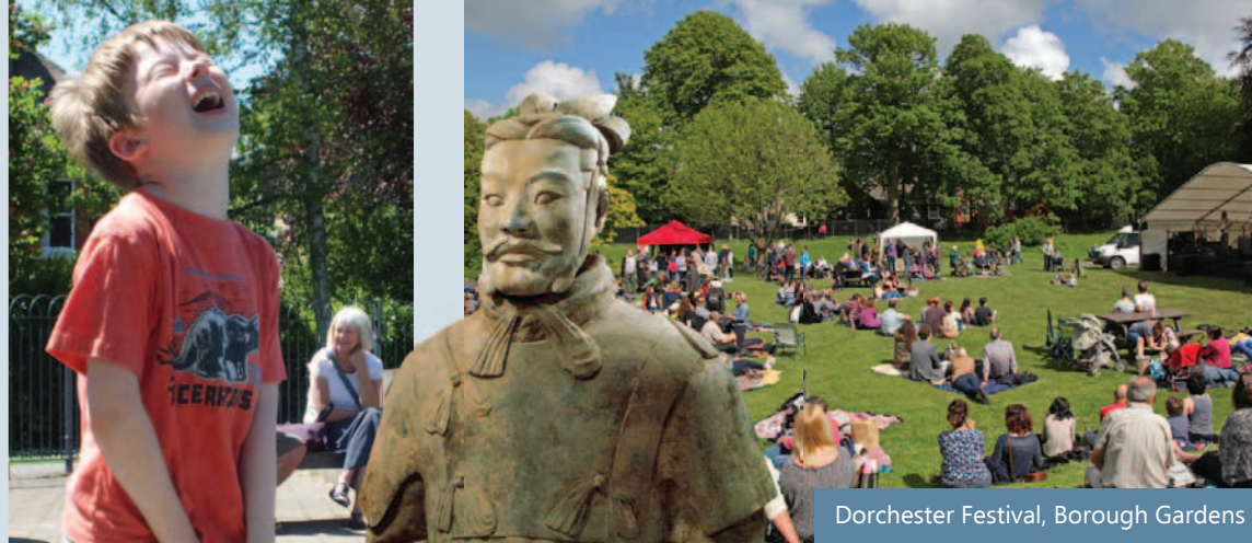
Dorchester Festival, Borough Gardens