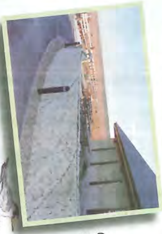
Chesil Beach Centre