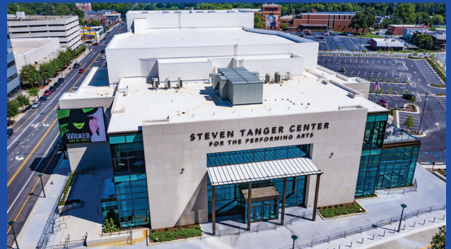
Steven Tanger Center for the Performing Arts

Barrel Room One Thirteen Brewhouse Bourbon Bowl Oniees Engagements Essential Hemp Savor the Moment Bakery Iron & Cloth Barbershop Steven Tanger Center for the Performing Arts Lewis + Elm Wine Bar Stolen Skateshop (new location) Luxe Soulfood + Cocktails Zaytoon Oh Goodness Bakery