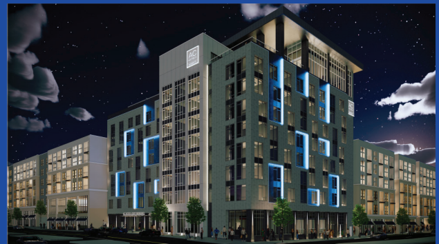
Carroll South of the Ballpark Rendering

'Cille and 'Scoe Northern Roots Coffeehouse Elm and Bain Parkside Pull-up Find Your Flow Fitness Pop Vintage Fiber Space Rockhouse Lark Fitness Standout Vintage Lawn Service The Selfie Spot Lee/Wrangler Hometown The Borough Market + Wine Bar Studio (new location) Transform GSO (expanded space) Hampton Inn Hype Clinic