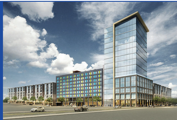
Carroll South of the Ballpark Rendering

Currently, downtown has $195 million of investment under construction, with $565 million in investment to come.