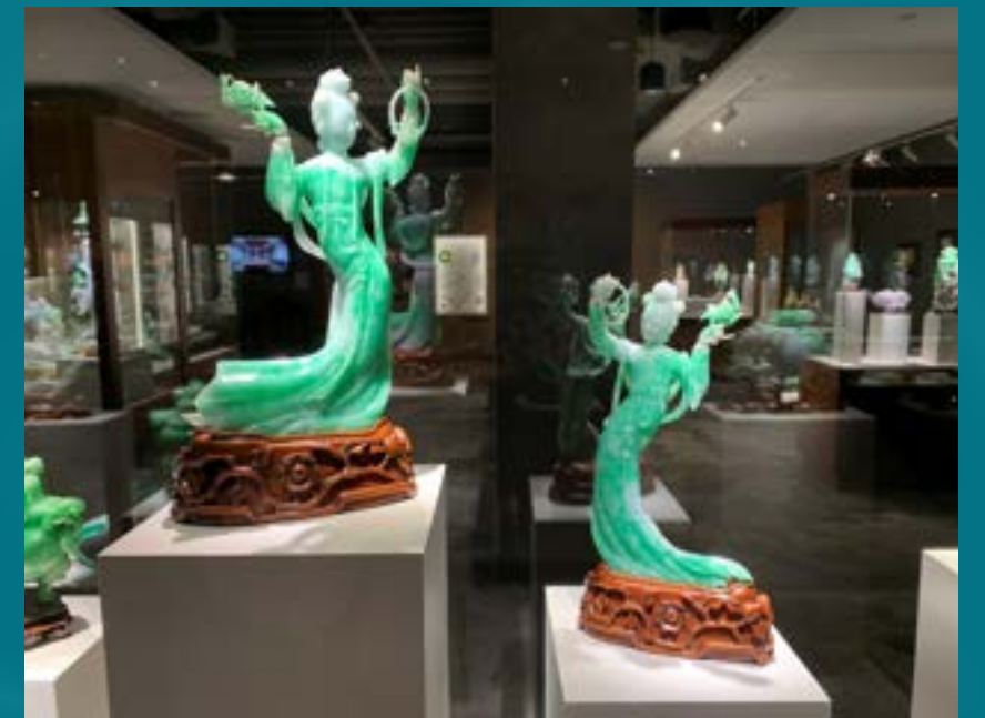
Lizzadro Museum of Lapidary Art, Oak Brook