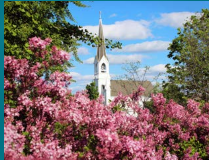
Lilacia Park, Lombard

Peacefully roam or actively explore one of DuPage's 60 forest preserves , never more than ten minutes away.