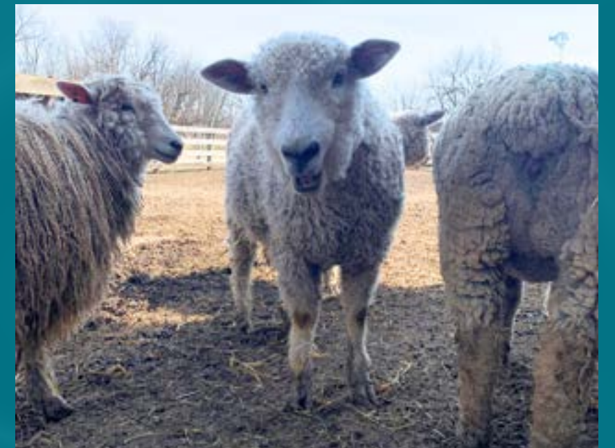
Kline Creek Farm, West Chicago