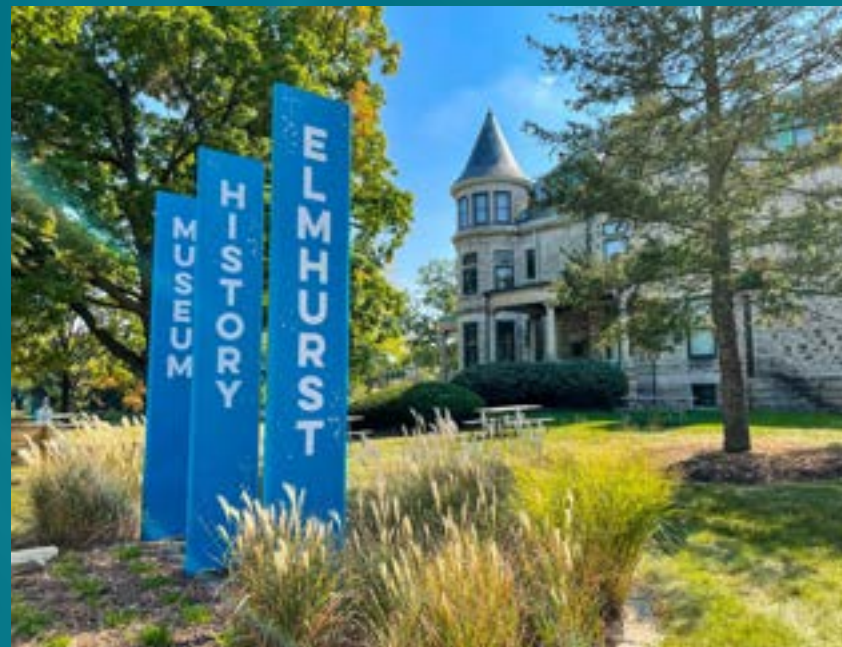
Elmhurst History Museum, Elmhurst