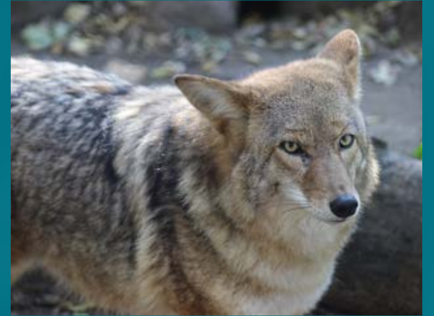
Cosley Zoo, Wheaton