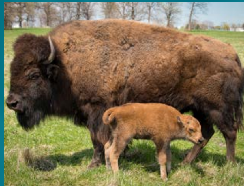
Fermilab Natural Areas, Batavia