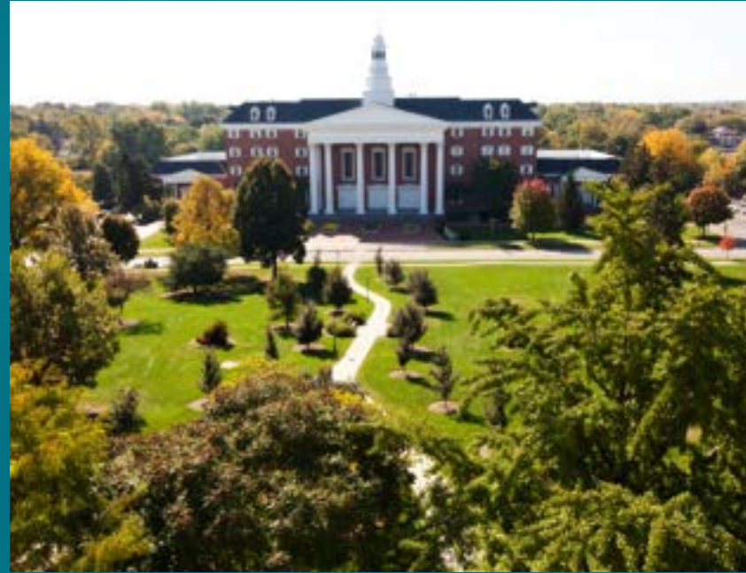
Billy Graham Center Museum, Wheaton