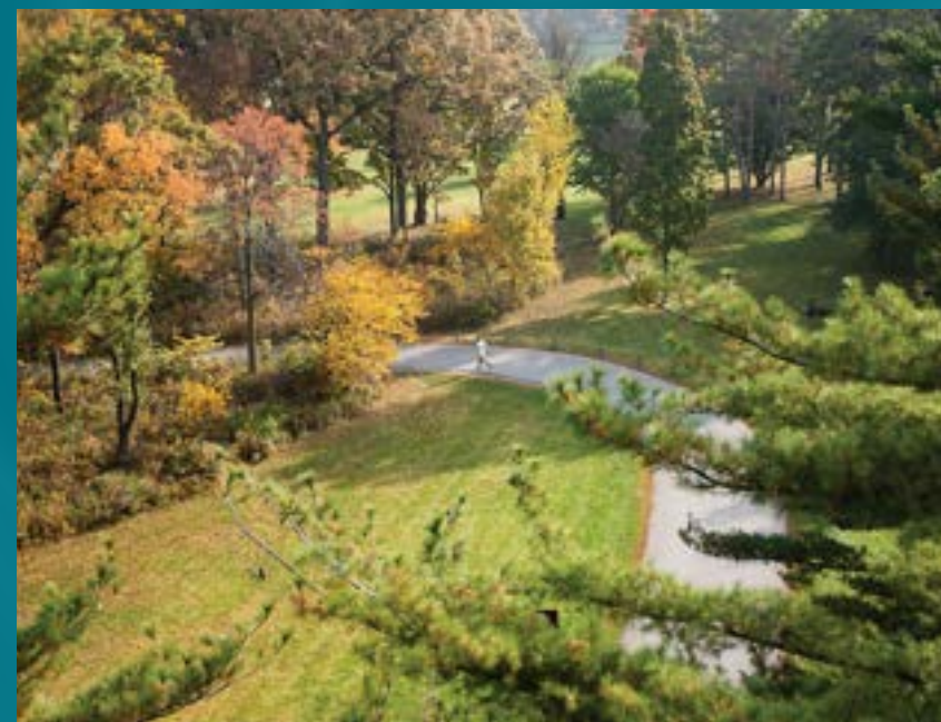
The Morton Arboretum, Lisle