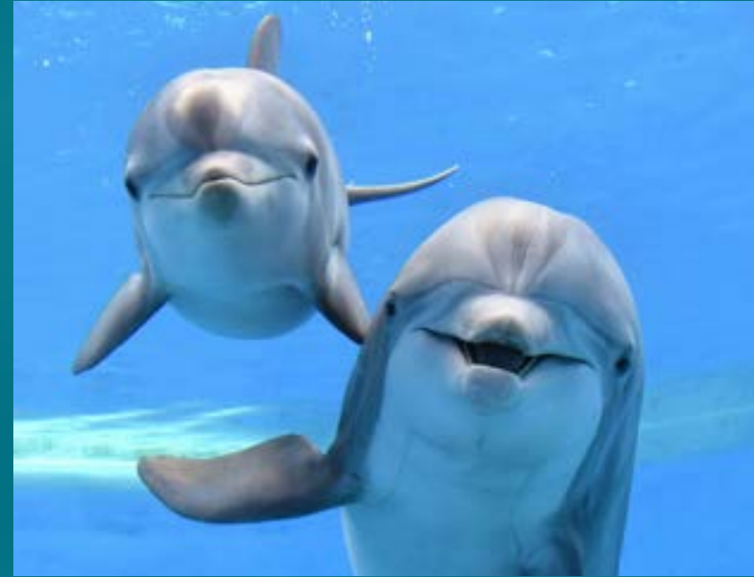
Brookfield Zoo, Brookfield

DuPage's animal oases are well known for their efforts in animal conservation and preservation . From nationally accredited zoos to small farms, you can learn about several types of species.