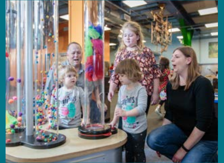
DuPage Children's Museum, Naperville