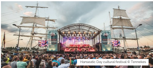
Hanseatic Day cultural festival