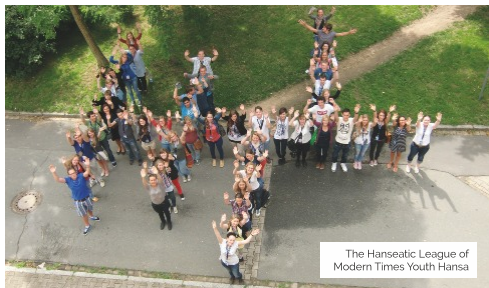
The Hanseatic League of Modern Times Youth Hansa