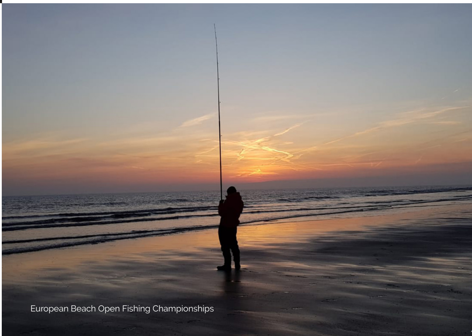
European Beach Open Fishing Championships

VHEY is a partnership between East Riding of Yorkshire Council, Hull City Council and local private sector businesses which leads and coordinates a range of activities with a strong focus on improving the visitor experience and increasing visitor spend. Working collectively as partnership provides greater opportunity to extend the existing event, festival and project portfolio across East Yorkshire and Hull.