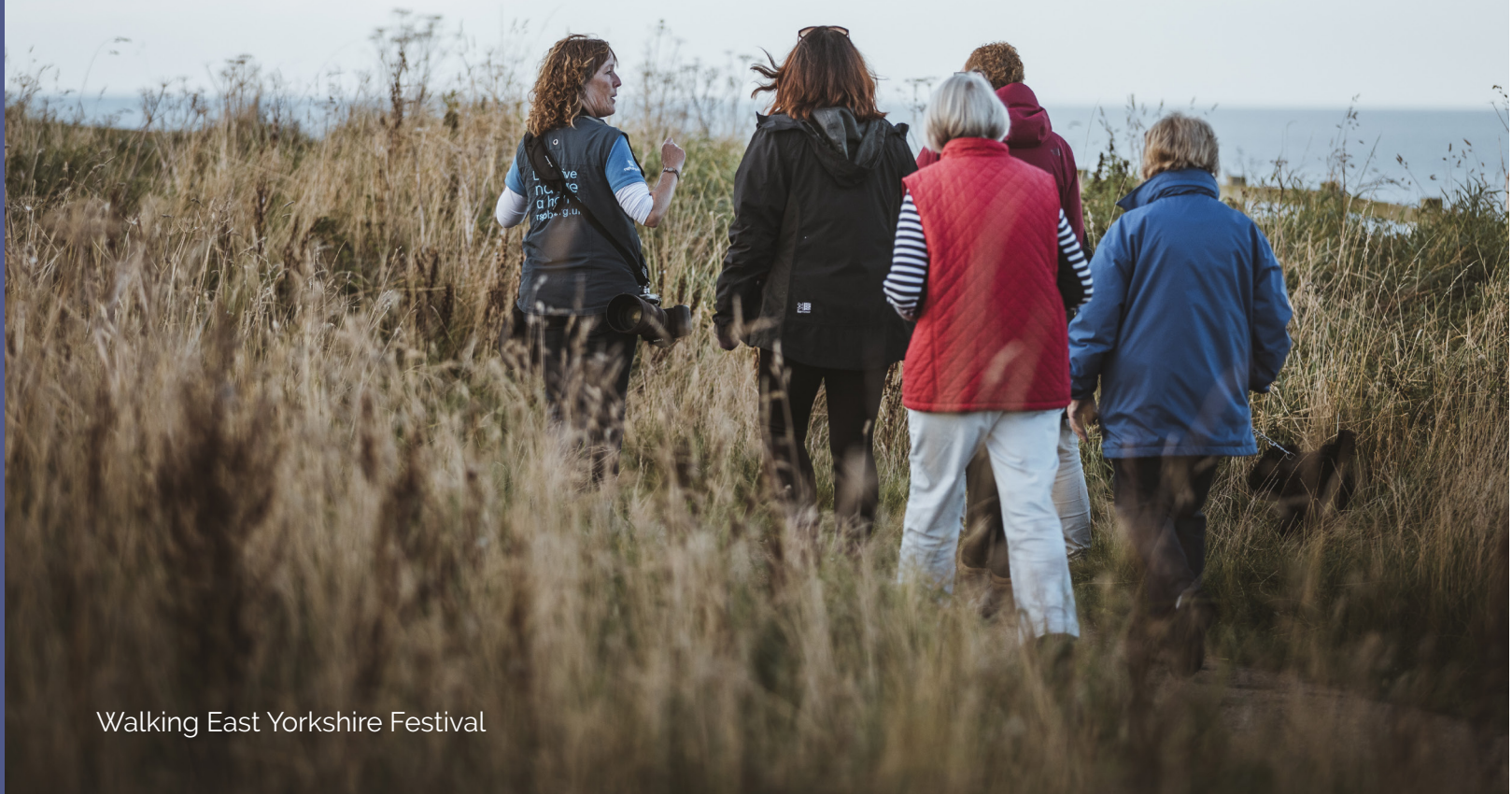
Walking East Yorkshire Festival

The Visit East Yorkshire (VEY) Events Team sits within Visit East Yorkshire with the responsibility of delivering a number of flagship tourism events and projects which positively impact East Yorkshire's visitor economy.