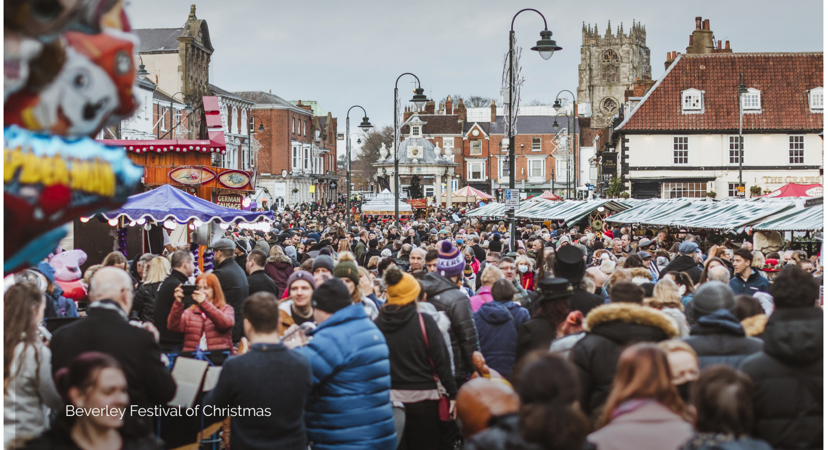
Beverley Festival of Christmas