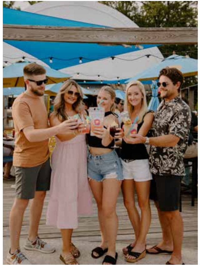
Pinky's at Lake Sara

217.868.2628 8726 E. Marine Dr., Exit 160