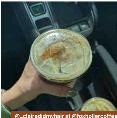
@_clairedidmyhair at @foxxhollercoffee