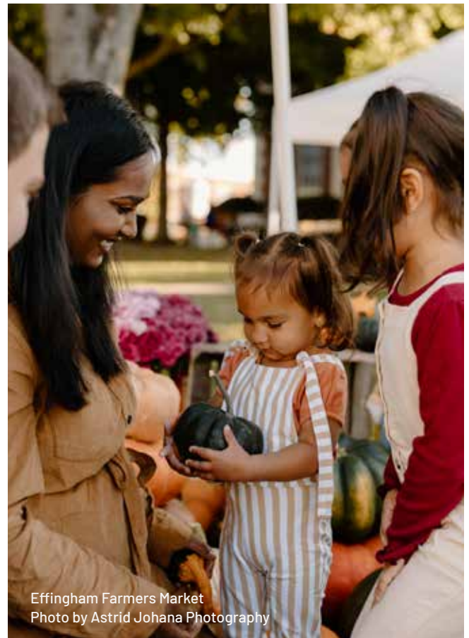
Effingham Farmers Market

Downtown Effingham, Exit 159 US 45 and Jefferson Ave.