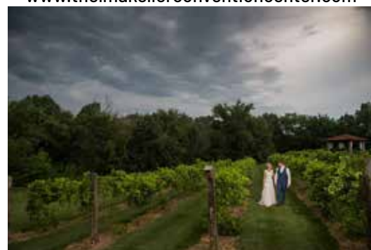
TUSCAN HILLS WINERY | 217.347.9463 www.effinghamwinery.com