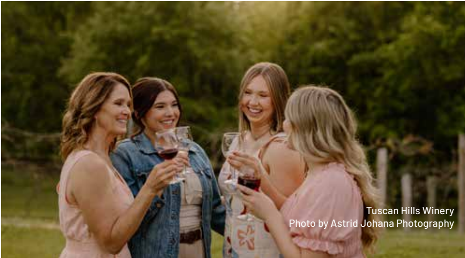
Tuscan Hills Winery