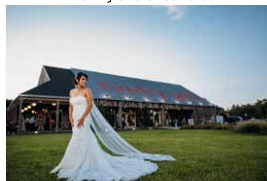
FIREFLY GRILL | 217.342.2002 www.ffgrill.com