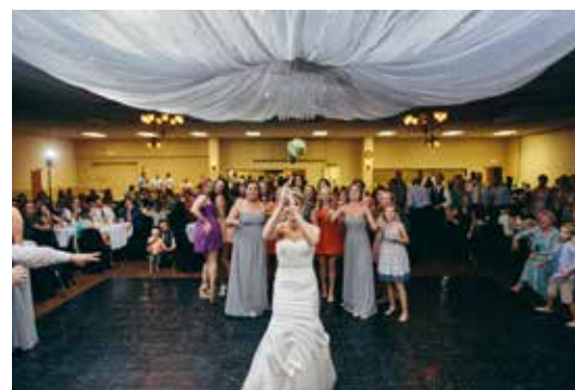
EFFINGHAM EVENT CENTER | 217.342.6565 www.effinghameventcenter.com