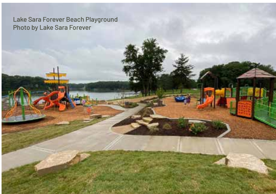
Lake Sara Forever Beach Playground