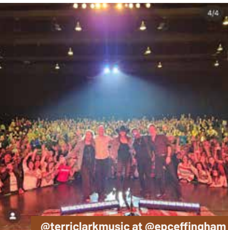
@terriclarkmusic at @epceffingham