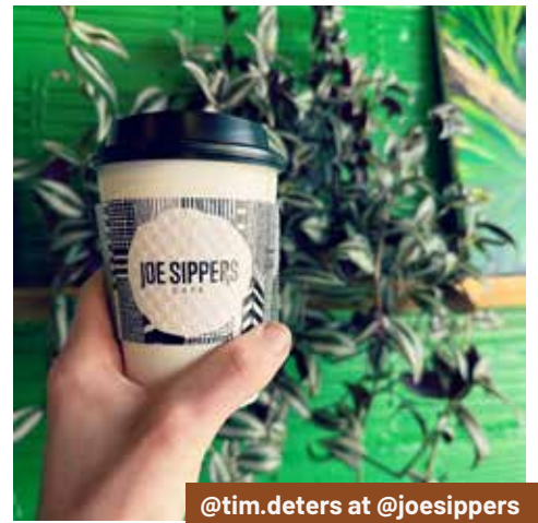
@tim.deters at @joesippers