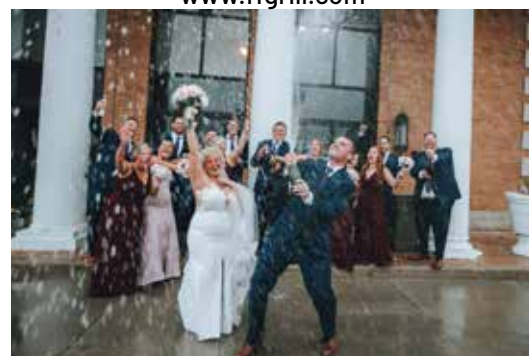
THELMA KELLER CONVENTION CENTER | 217.347.5115 www.thelmakellerconventioncenter.com