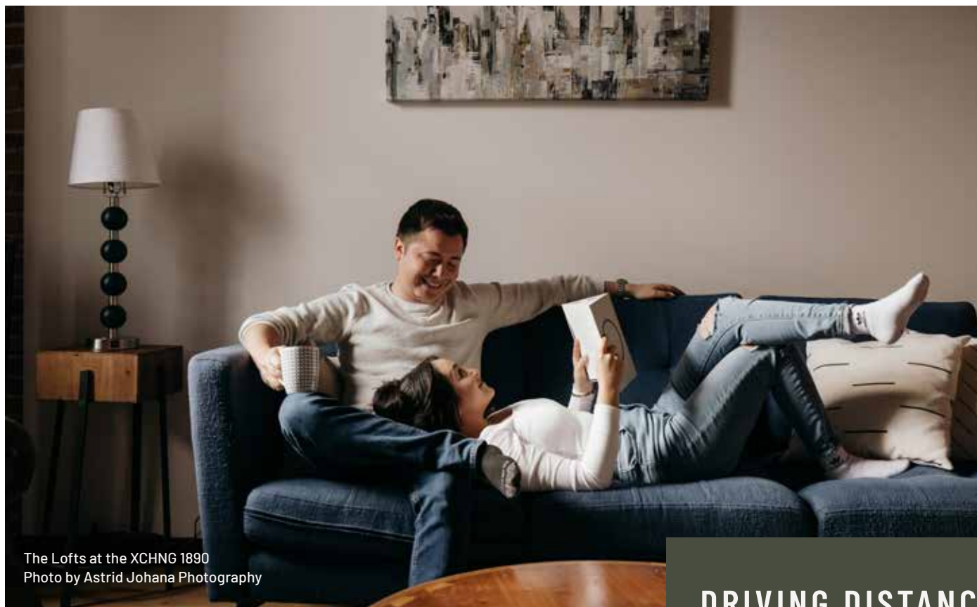
The Lofts at the XCHNG 1890