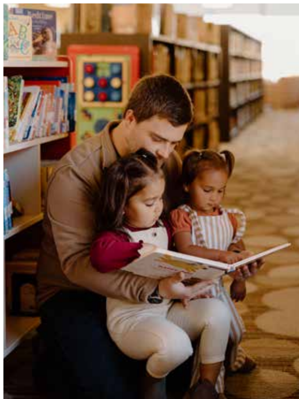
Effingham Public Library