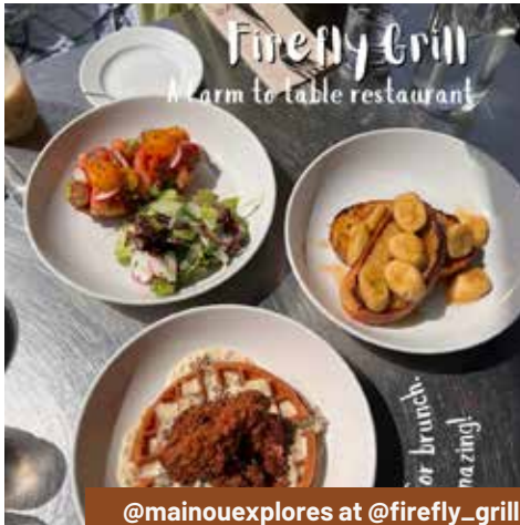
@mainouexplores at @firefly_grill