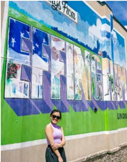
Greetings Effingham Mural