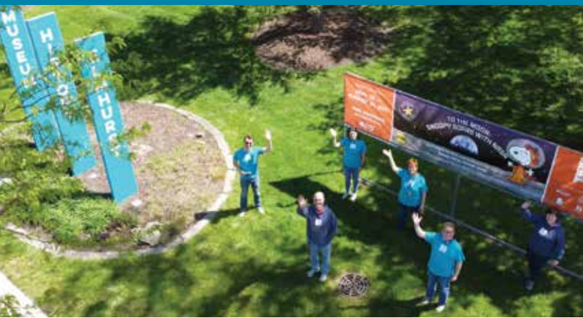
EHM Staff, May 2021

History teaches us all that tough times will pass, and we will undoubtedly find positive ways to learn and improve as a result of the last two years. Here are a few of the highlights that made 2021 a memorable year despite the many obstacles in our paths: