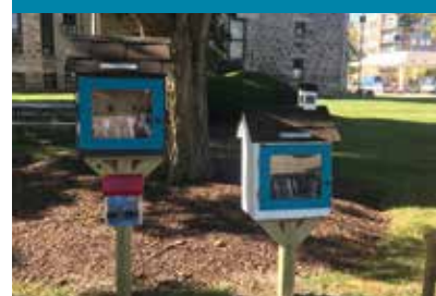
New Little Libraries