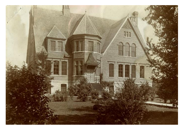
Elmhurst Public School, circa 1900. P73.1.4

business district centered around York Street and the Chicago and North Western Railroad. The majority of the businesses were housed in frame buildings with residences interspersed among the stores. The <u>Glos Block</u> was an imposing three-story brick structure on the southeast corner of York Street and Park Avenue that housed the post office, the bank, a grocery store, and a public hall. Electricity, telephone service, and water were available to Elmhurst residents, but were relatively new to the community, so not everyone had access to them.