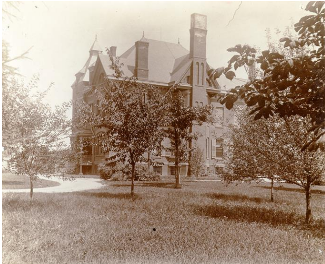
"York Manor" at 203 S. York Street in Elmhurst c. 1900