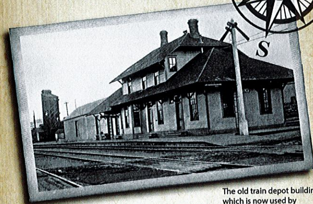
The old train depot building which is now used by "Wilderness Outfitters."