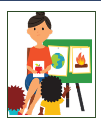
Center-based infant care $15,600