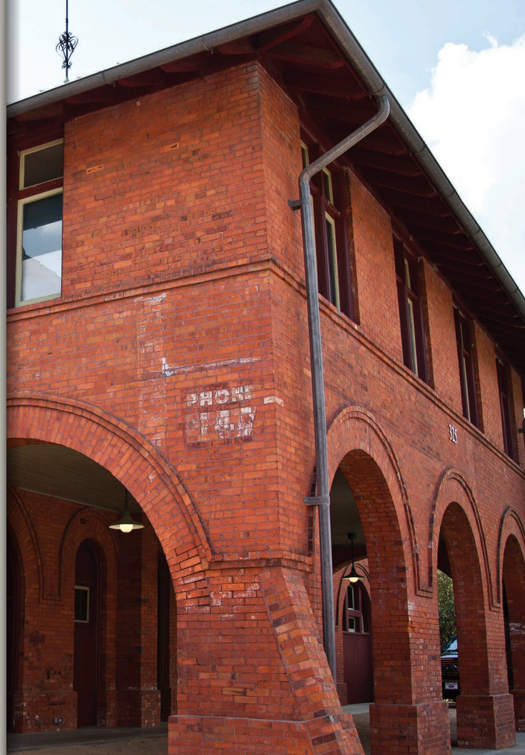
FAYETTEVILLE AREA TRANSPORTATION & LOCAL HISTORY MUSEUM

FATM exhibits contributions made by local African-Americans. The museum also has staff oversight of Fayetteville's Historic Districts and Designated Local Landmark Properties, many of which have strong ties to African-American history. Maintained in the museum archives are all the National Register and Local Landmark nominations for use by researchers. Also the museum is a repository of historical information concerning local African-Americans. Museum staff is available to assist with directed research in the area of local African-American history as well as give guided Historic Downtown Walking Tours for groups of 20 or more.