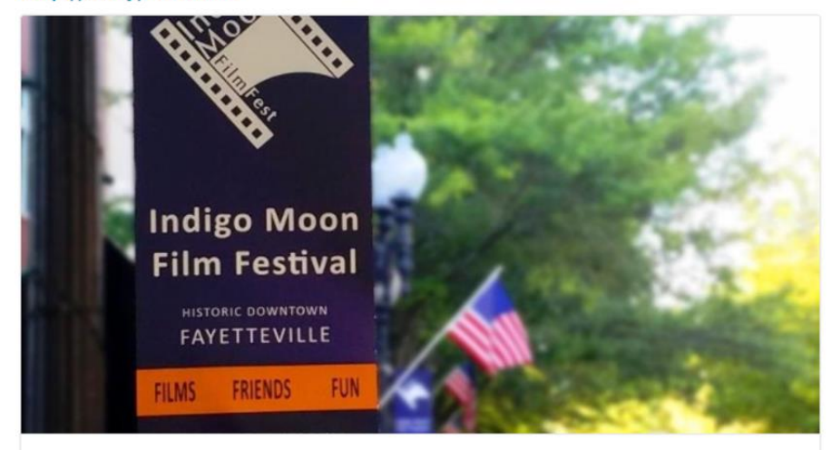
Calling All Film Fanatics & Arts Lovers! gofayetteville.com

Seven Reasons to attend Fayetteville's Indigo Moon Film Festival #IMFF2017 http://bit.ly/2xAAMR9