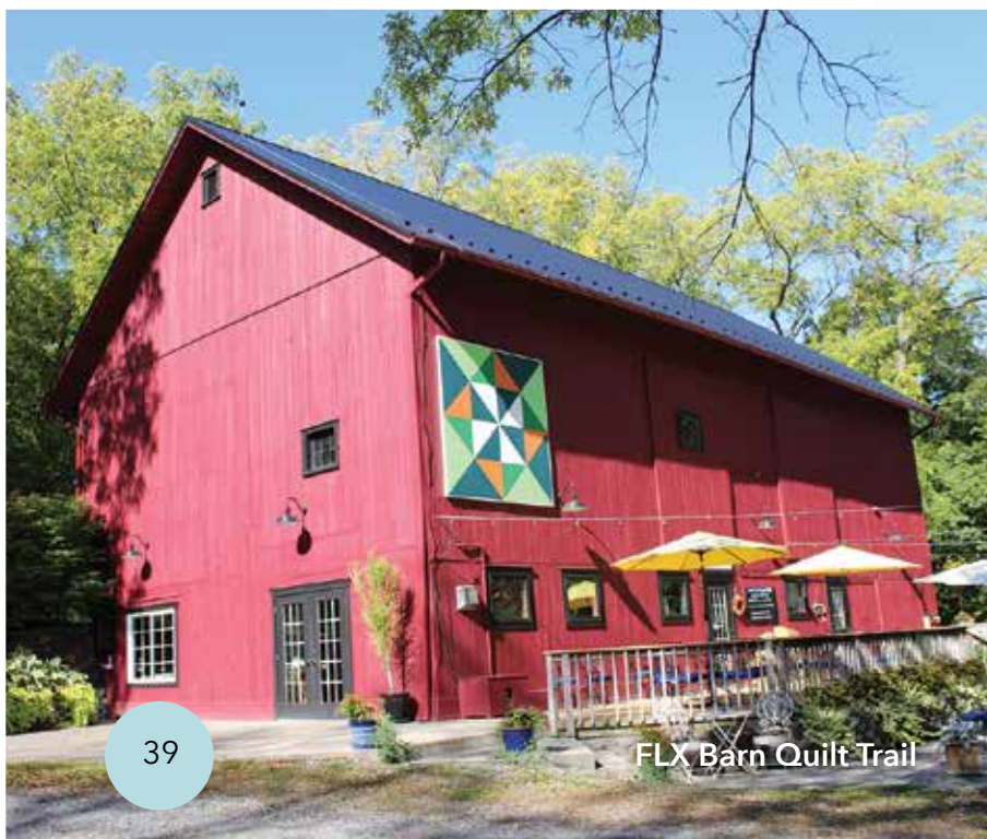
FLX Barn Quilt Trail