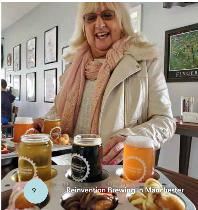
Reinvention Brewing in Manchester