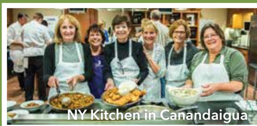
NY Kitchen in Canandaigua

With vibrant communities, rolling hillsides, glacier-carved lakes, and award-winning wineries and breweries, Ontario County in the Finger Lakes region is an unforgettable location for your next group experience.