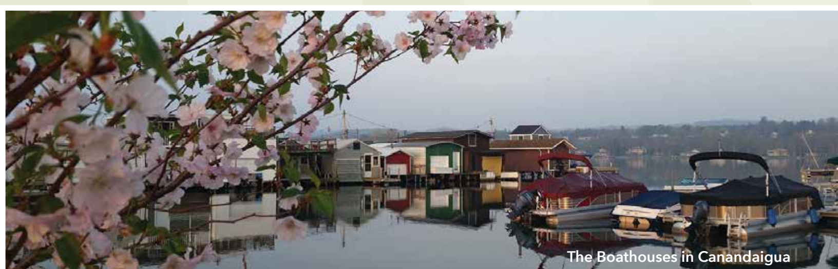
The Boathouses in Canandaigua

Please note: NYS guidance on Covid-19 is continually changing. These images may not reflect current guidelines and practices of NYS public health policy. Please check at the time of your visit for requirements that are in place for the health and safety of our guests and our tourism workforce.