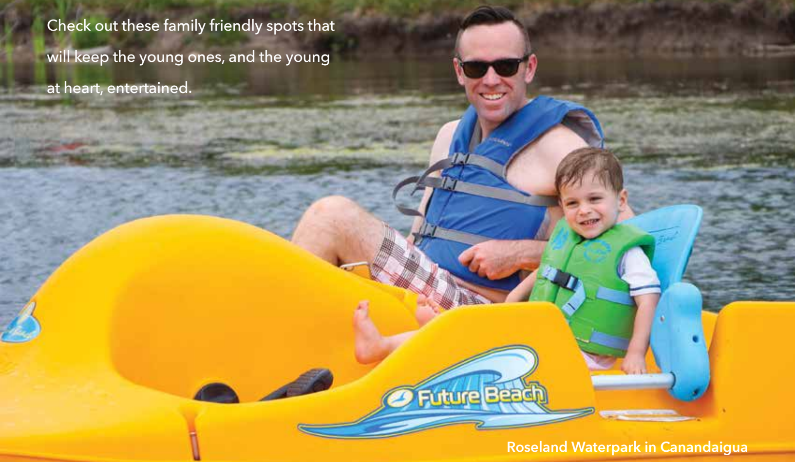
Roseland Waterpark in Canandaigua

Check out these family friendly spots that will keep the young ones, and the young at heart, entertained.