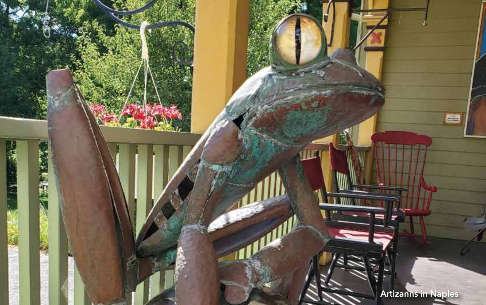
Artizanns in Naples

Small-town business owners, artists and craftspeople, especially those with their own shops, boutiques, and galleries, are all part of what makes shopping on vacation so much fun.