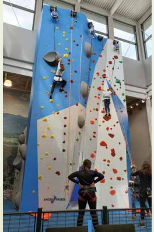
Dick's House of Sport at Eastview Mall, Victor