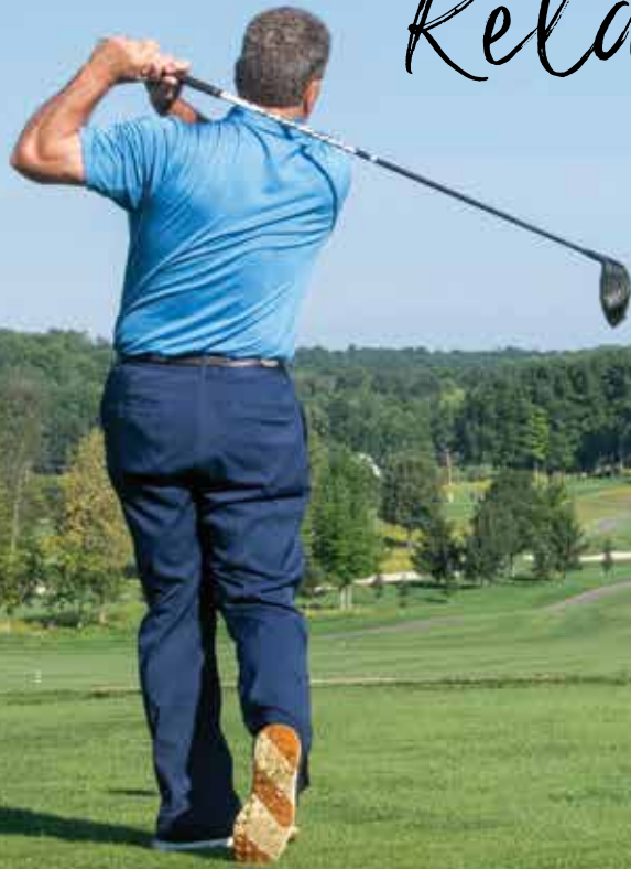
Ravenwood Golf Club in Victor