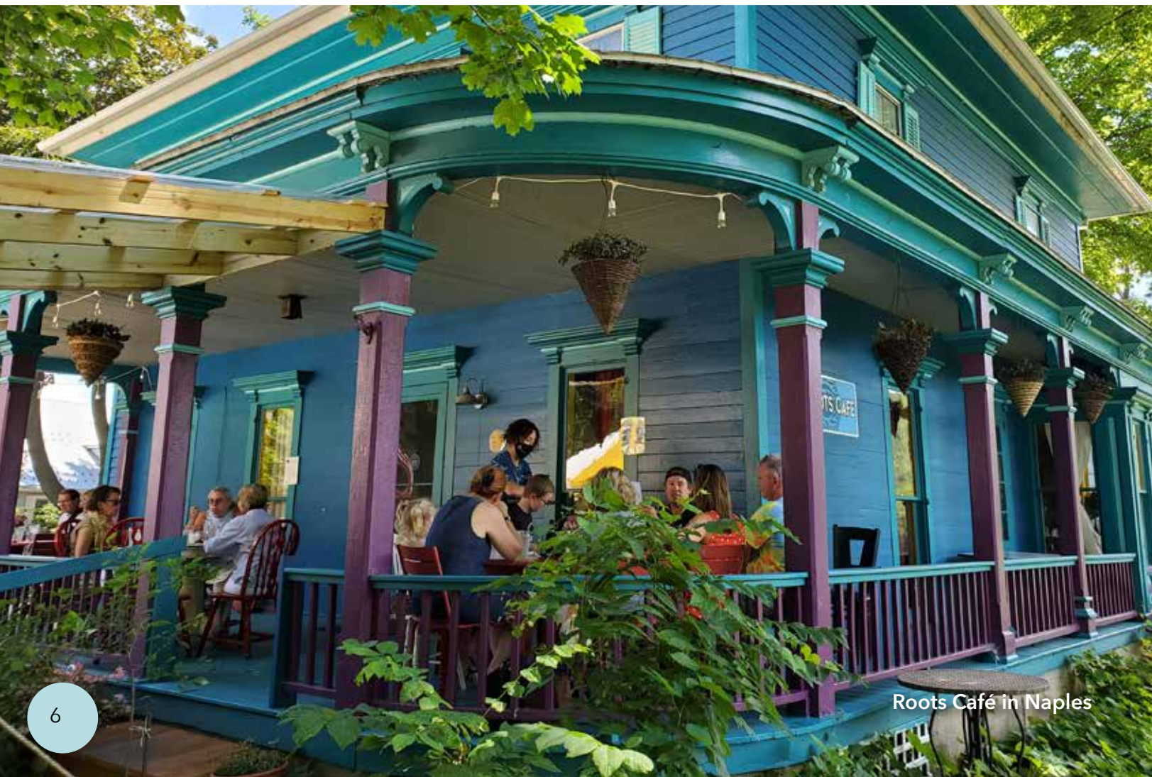
Roots Café in Naples