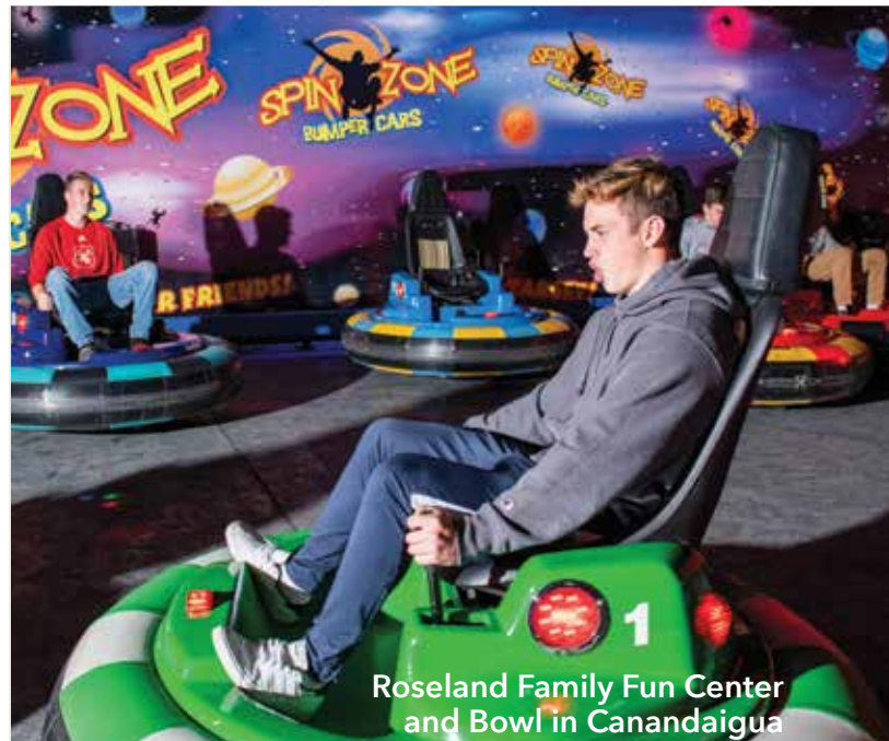
Roseland Family Fun Center and Bowl in Canandaigua