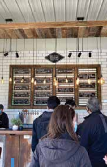
Big aLiCe Brewing, Geneva

When the going gets tough the Finger Lakes keeps going!