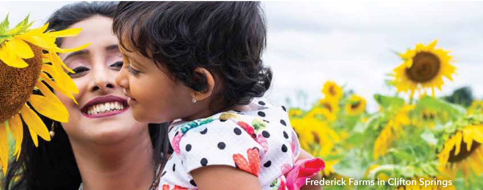
Frederick Farms in Clifton Springs