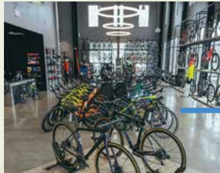
Tom's Pro Bike ROC, Victor