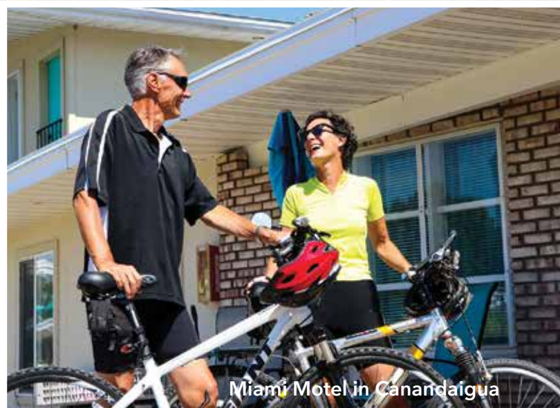
Miami Motel in Canandaigua