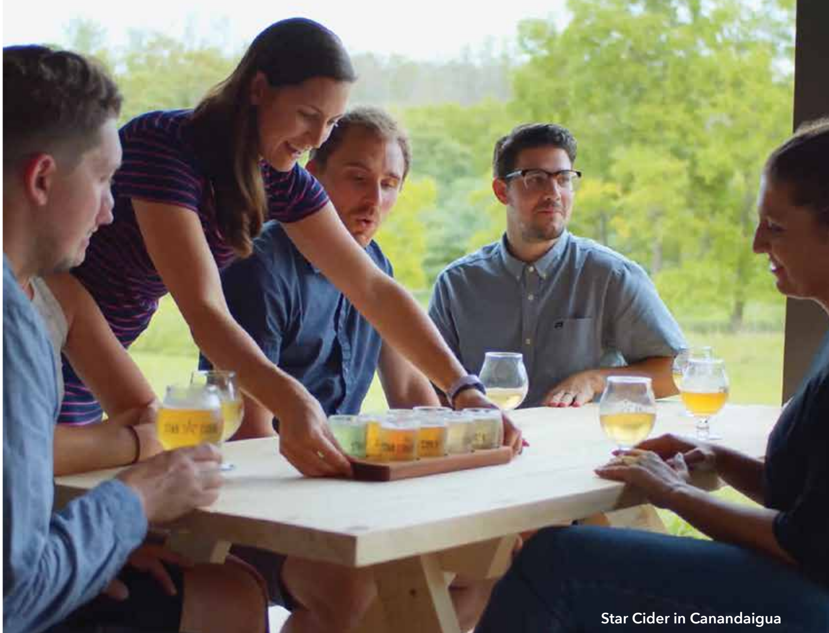
Star Cider in Canandaigua