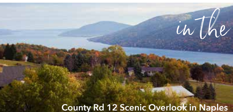
County Rd 12 Scenic Overlook in Naples