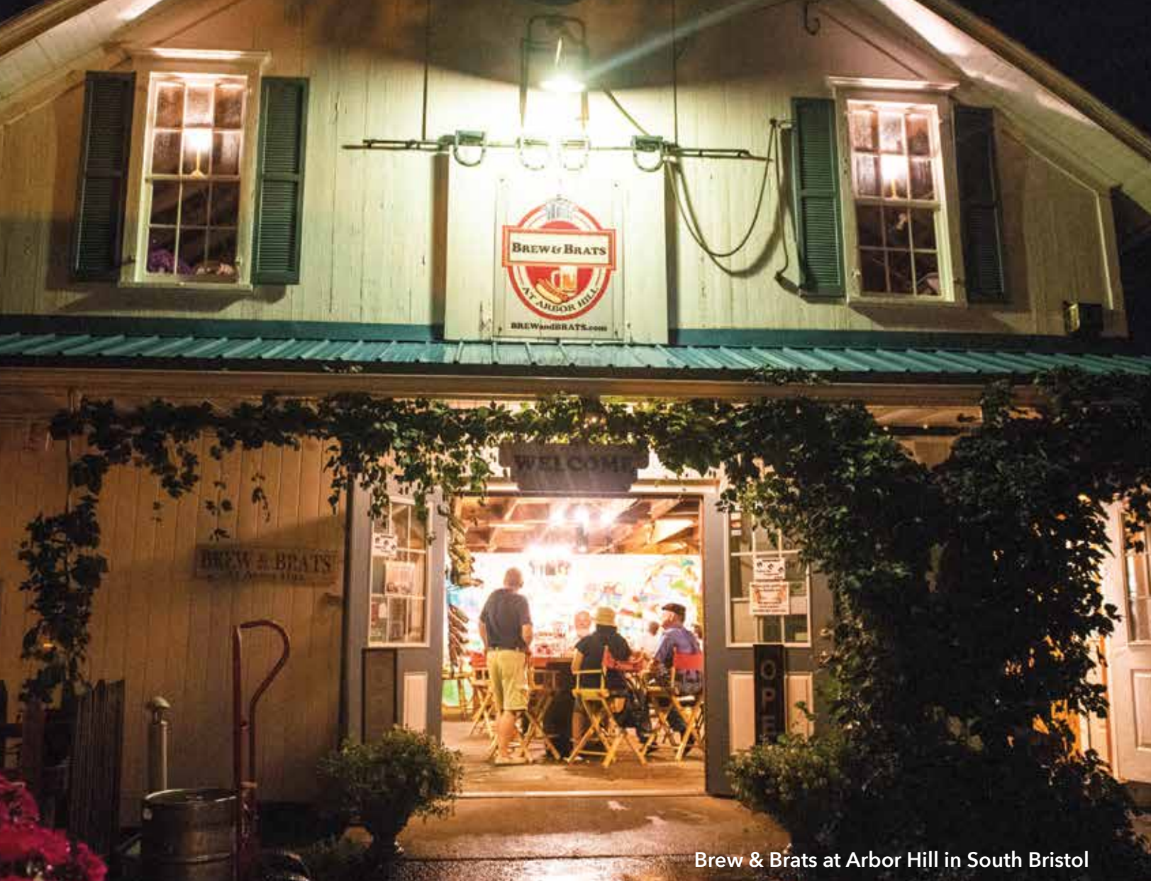
Brew & Brats at Arbor Hill in South Bristol