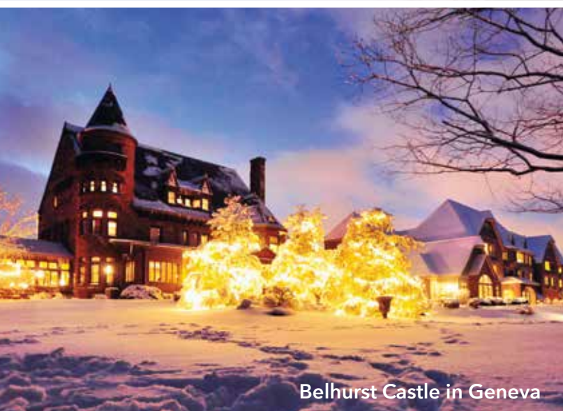
Belhurst Castle in Geneva