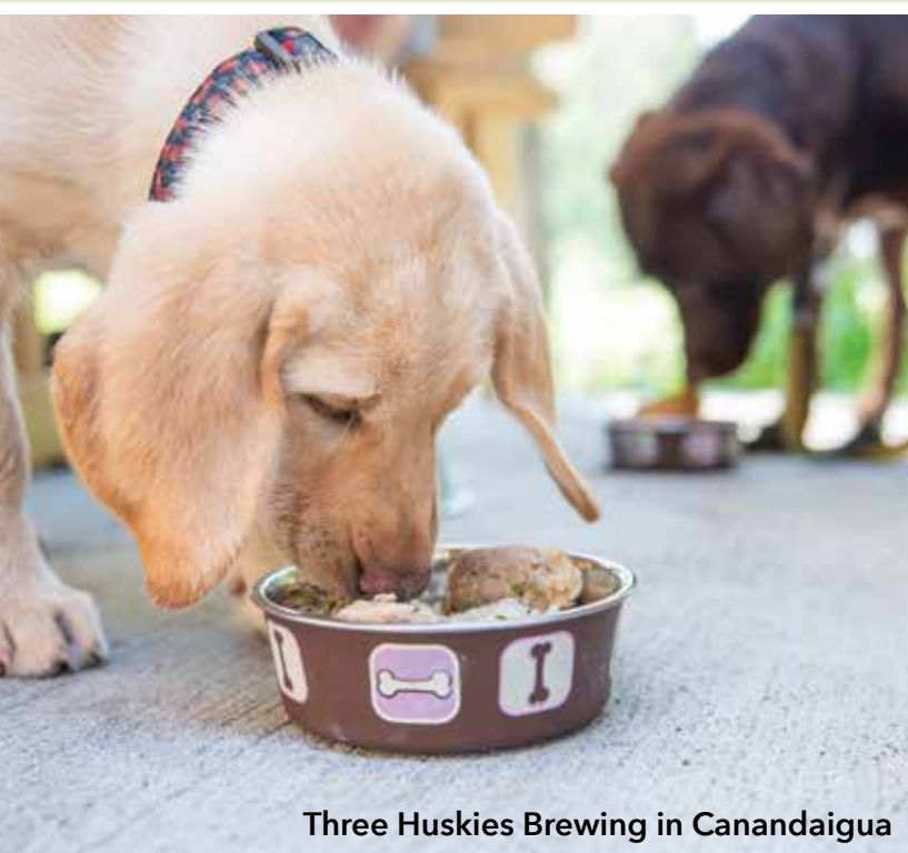
Three Huskies Brewing in Canandaigua

VisitFingerLakes.com//plan-your-trip/pet-friendly