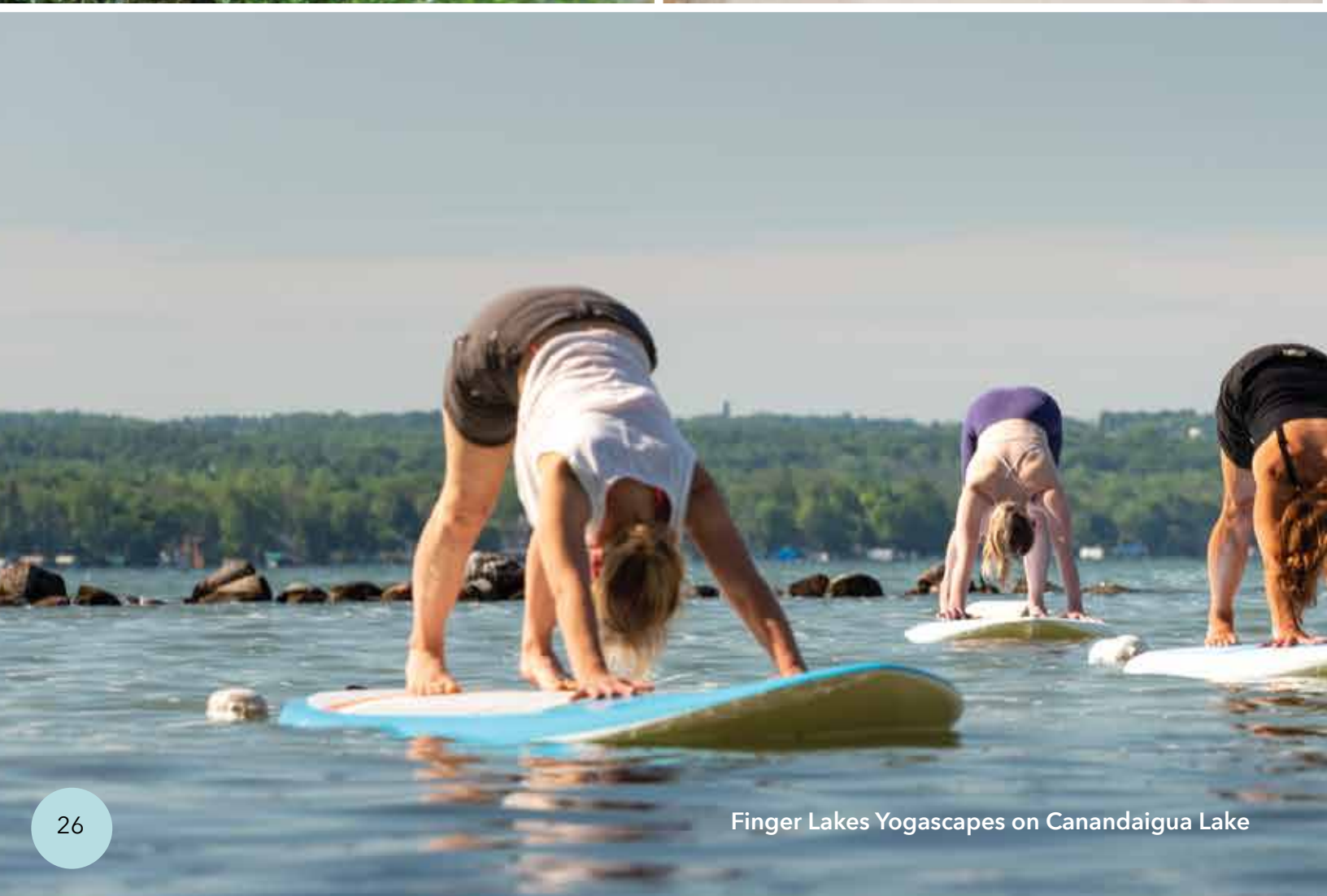
Finger Lakes Yogascapes on Canandaigua Lake