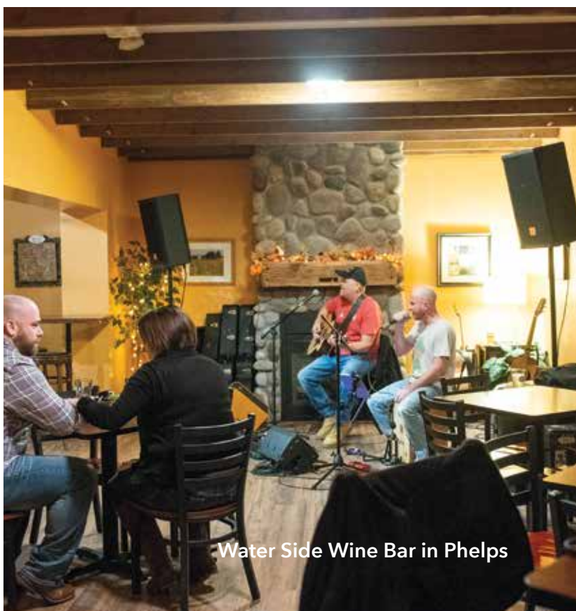
Water Side Wine Bar in Phelps