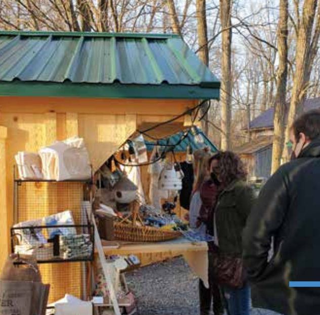
Birdhouse Brewing, Honeoye