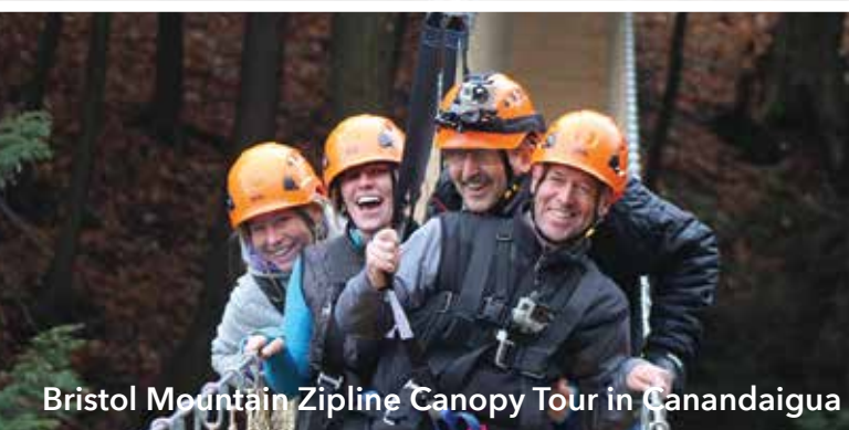
Bristol Mountain Zipline Canopy Tour in Canandaigua