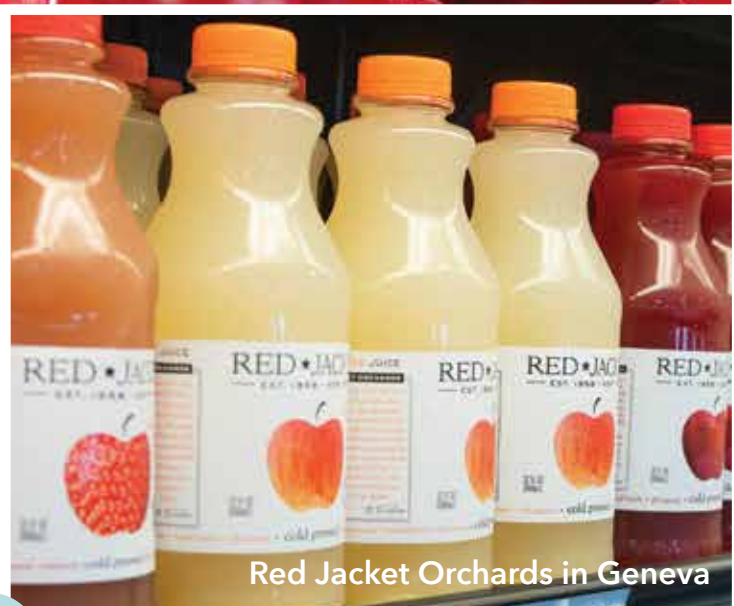
Red Jacket Orchards in Geneva