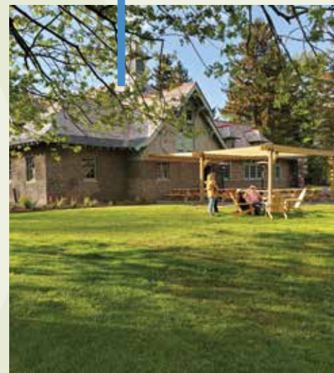
Ardennes Taproom and Kitchen, Geneva