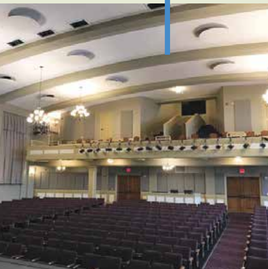
Fort Hill Performing Arts Center, Canandaigua