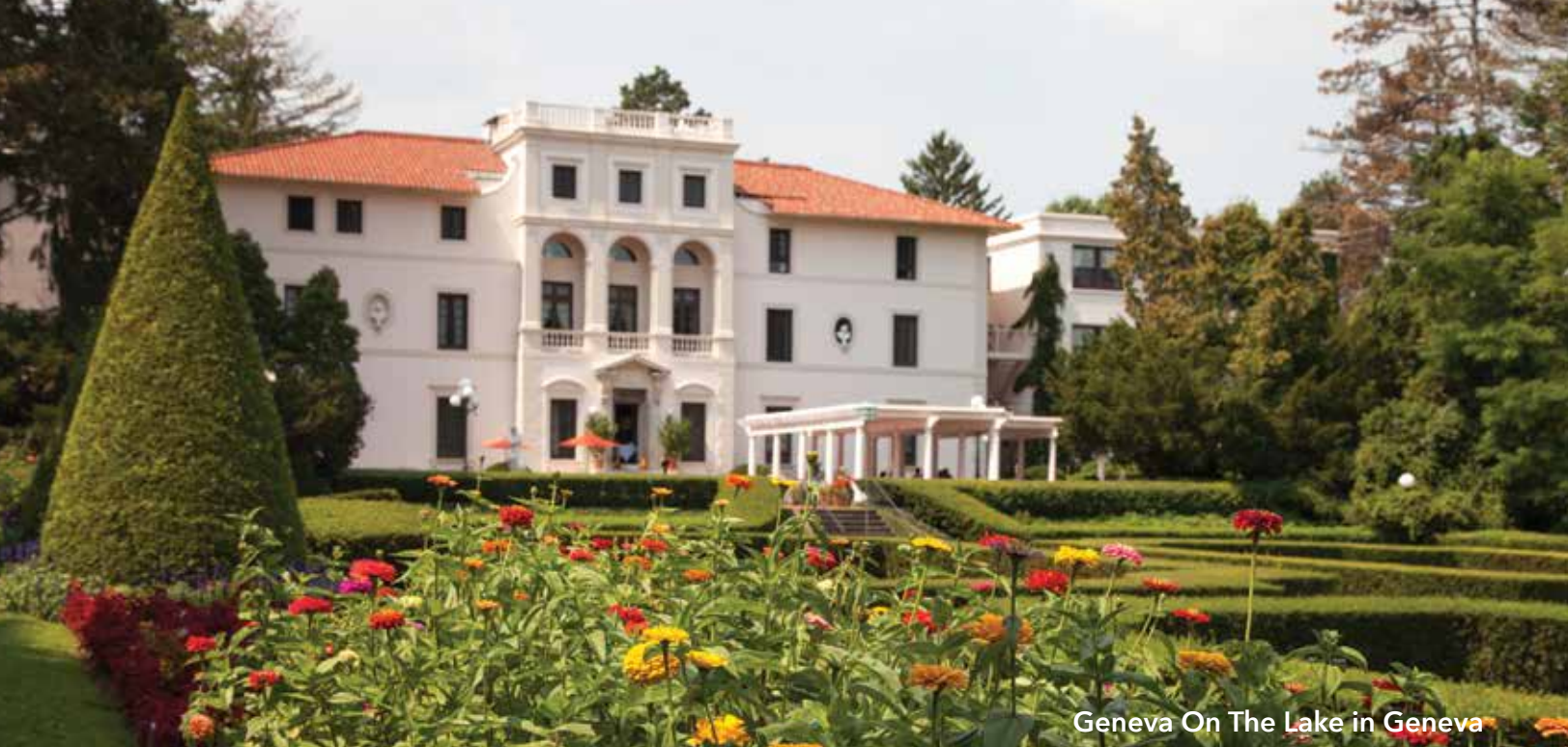
Geneva On The Lake in Geneva