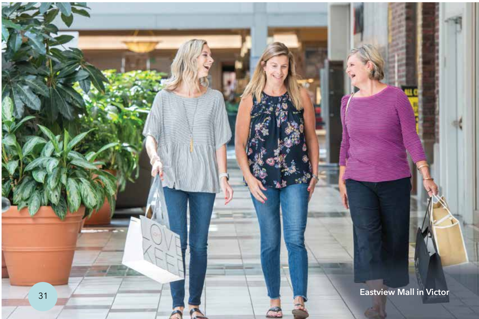
Eastview Mall in Victor