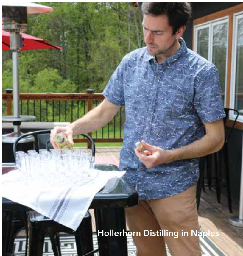
Hollerhorn Distilling in Naples