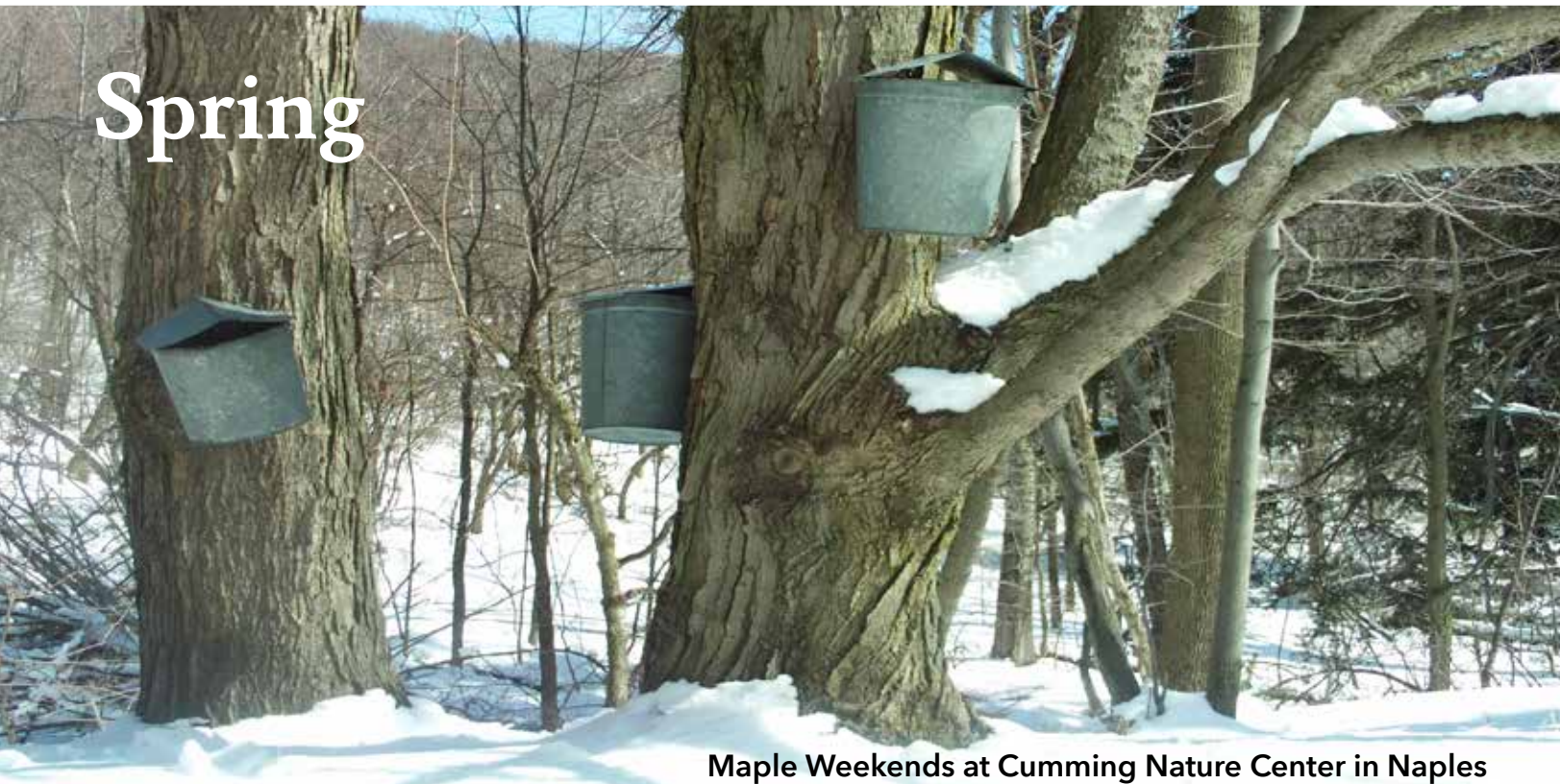
Maple Weekends at Cumming Nature Center in Naples

From late spring through winter, there are no shortages of local festivals to enjoy in the FLX.