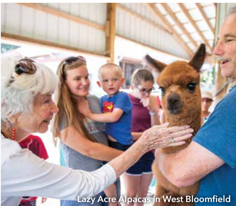
Lazy Acre Alpacas in West Bloomfield