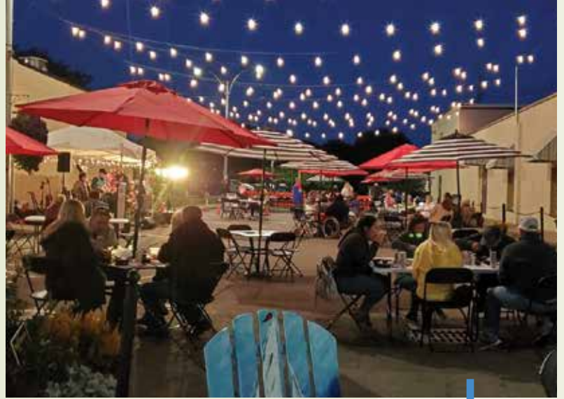
Central on Main, Canandaigua