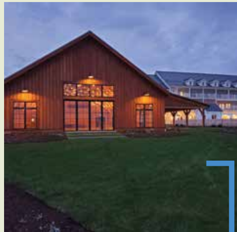
Lake House on Canandaigua