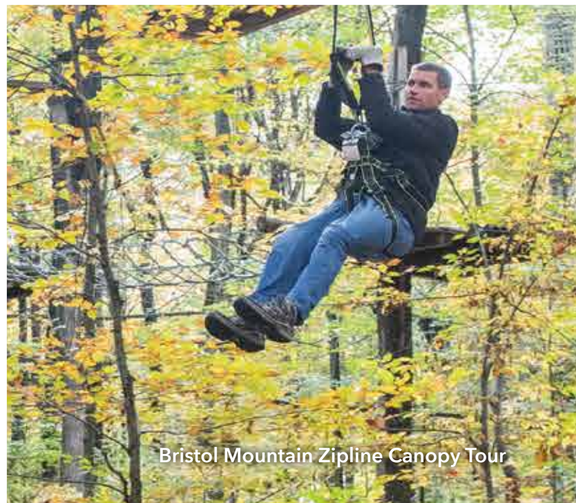
Bristol Mountain Zipline Canopy Tour