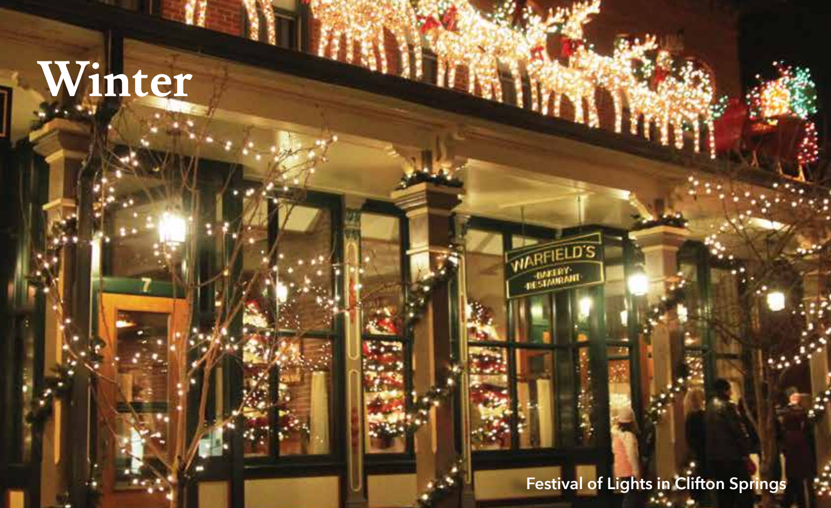
Festival of Lights in Clifton Springs