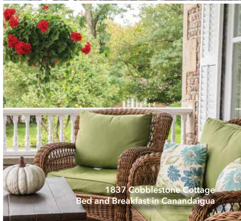
1837 Cobblestone Cottage Bed and Breakfast in Canandaigua