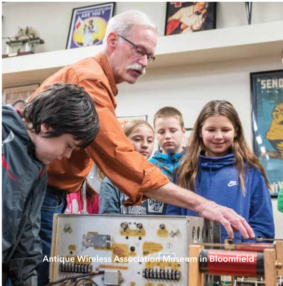
Antique Wireless Association Museum in Bloomfield