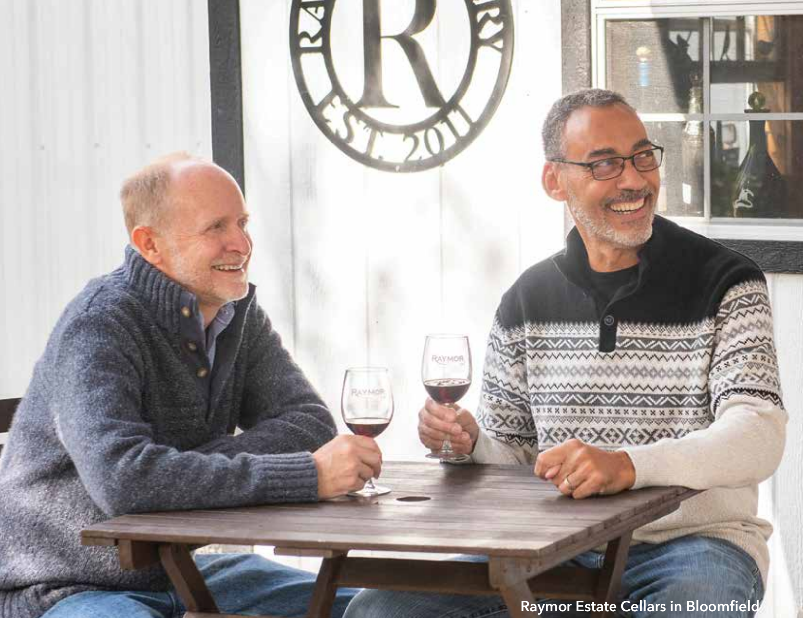
Raymor Estate Cellars in Bloomfield