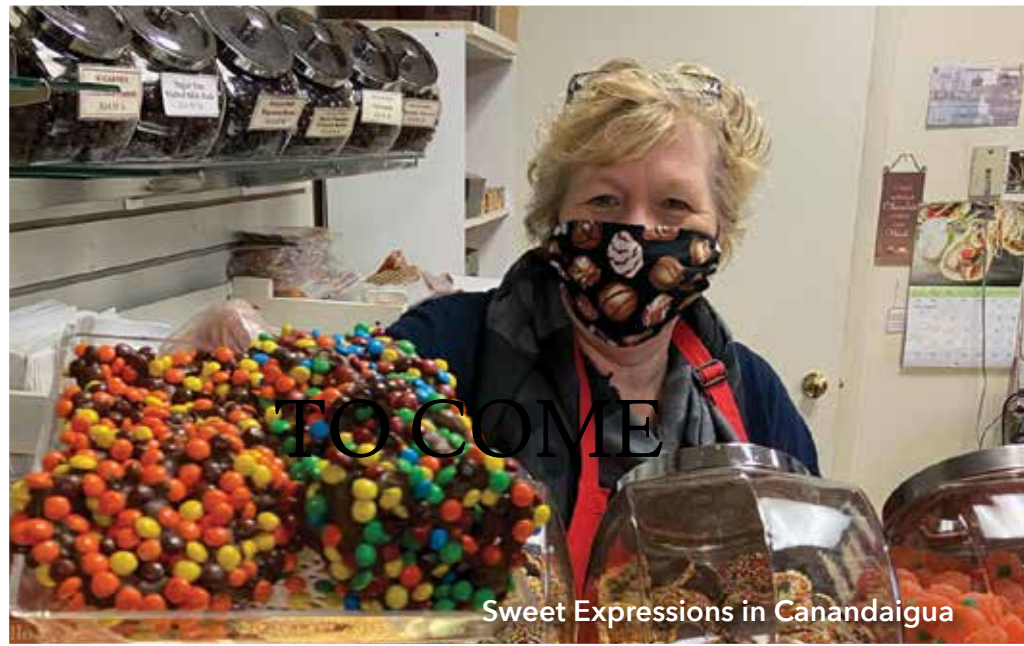
Sweet Expressions in Canandaigua

Small-town business owners, artists and craftspeople, especially those with their own shops, boutiques, and galleries, are all part of what makes shopping on vacation so much fun.