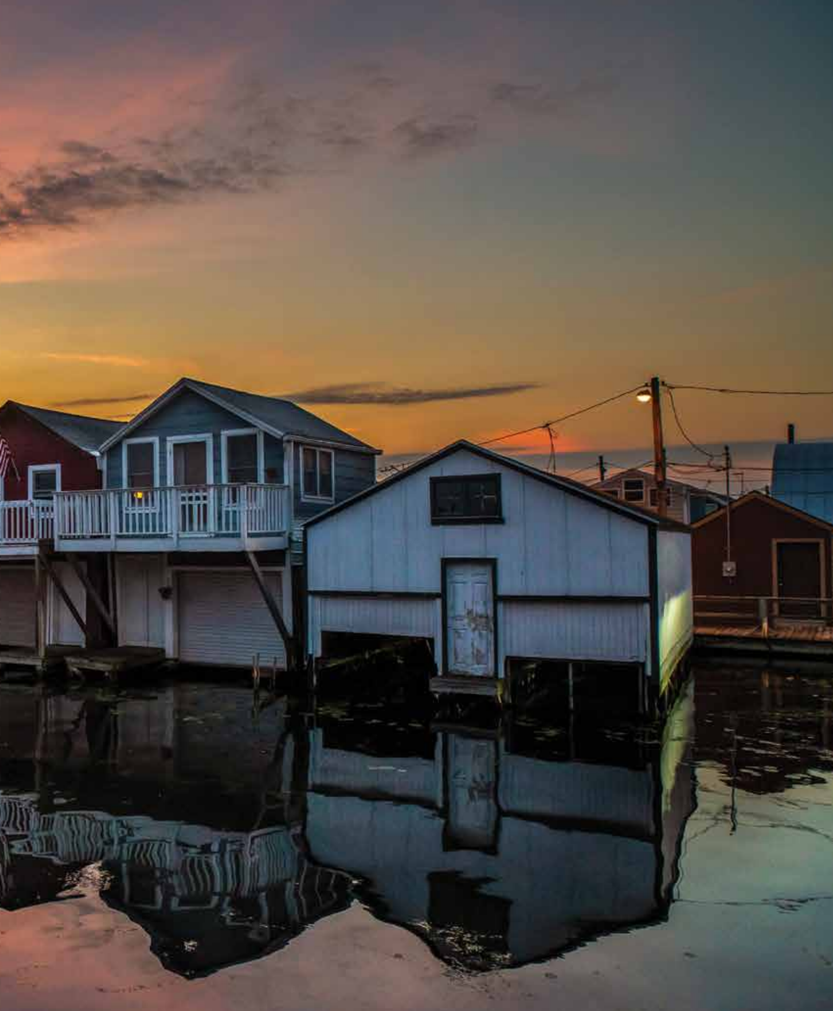
Sunsets on the Historic Boathouses at the Canandaigua City Pier, Canandaigua Lake, Rochester, NY