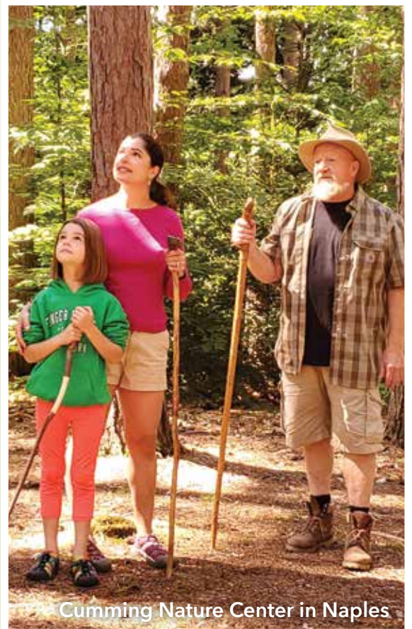
Cumming Nature Center in Naples