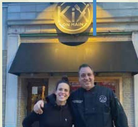
KiX on Main (and rooftop bar), Canandaigua