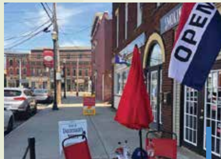
Smokin' Tails Distillery, Phelps