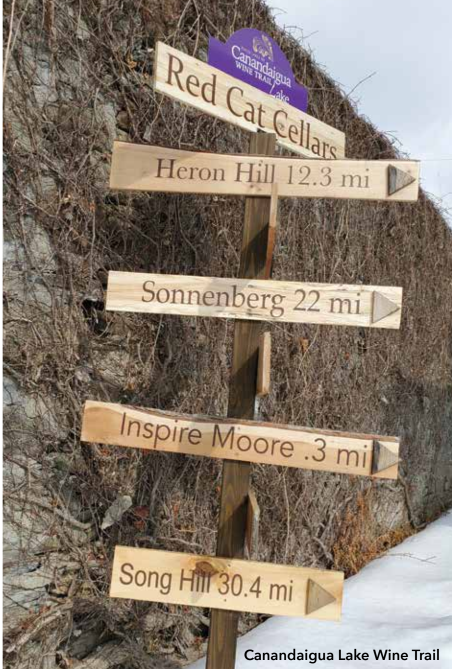
Canandaigua Lake Wine Trail

Our website has over 68 pages dedicated to different trails. Wine Trails, Beer Trails, Hike and Bike Trails, Barn Quilt Trail ... and more. The Finger Lakes is a region that's meant for trails. How do you find them all? Go to VisitFingerLakes.com and search the word trails! Soon, you'll be on your way to a good time, we promise!