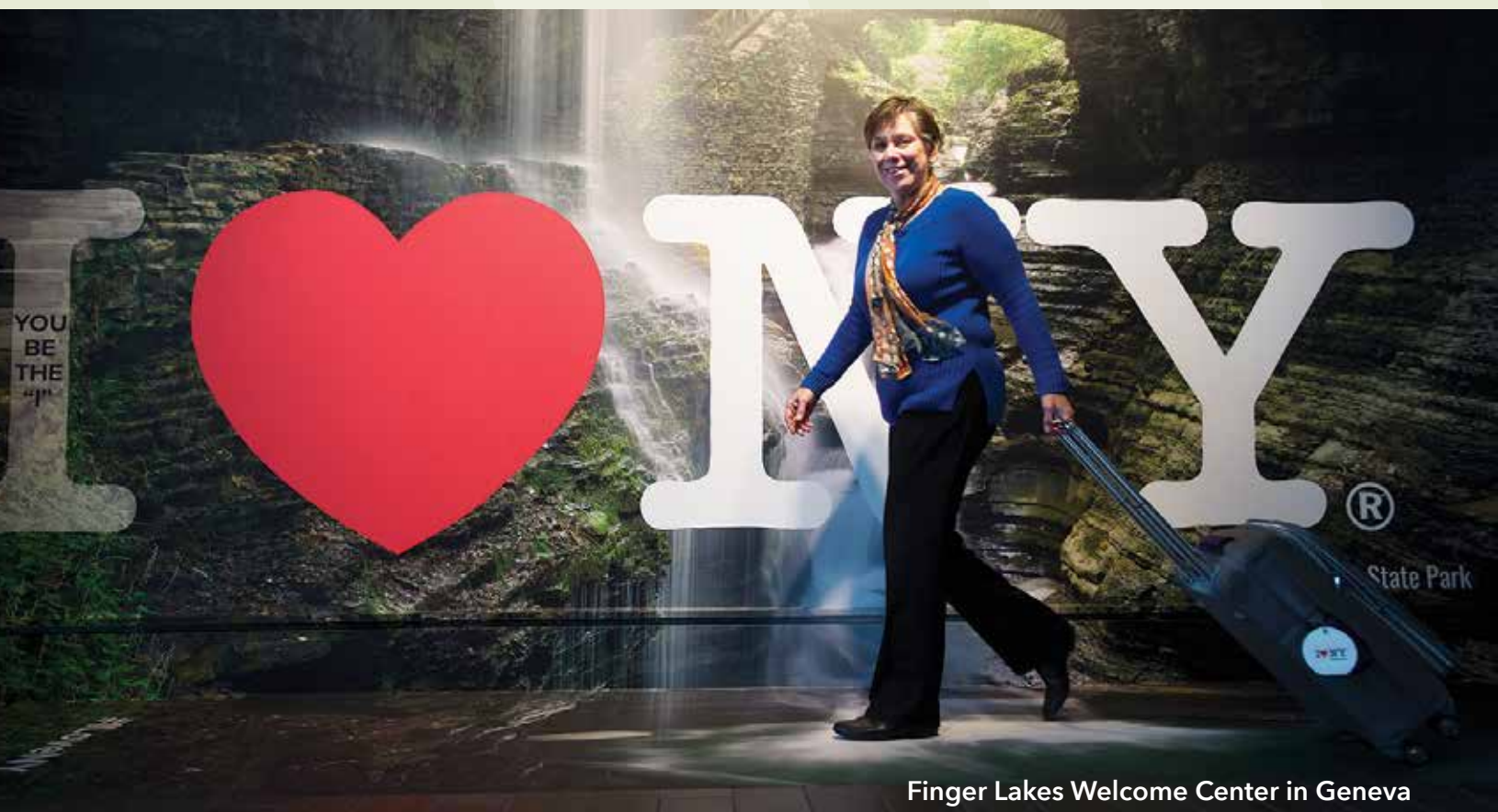
Finger Lakes Welcome Center in Geneva

It's time to get our travel lives back on.