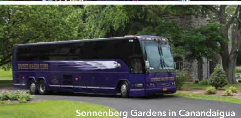
Sonnenberg Gardens in Canandaigua