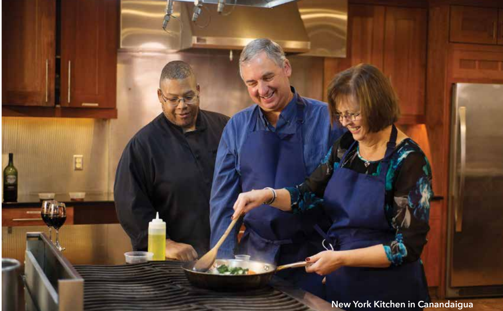
New York Kitchen in Canandaigua