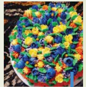
Fluffing Feathers & Flour, Manchester SEPT