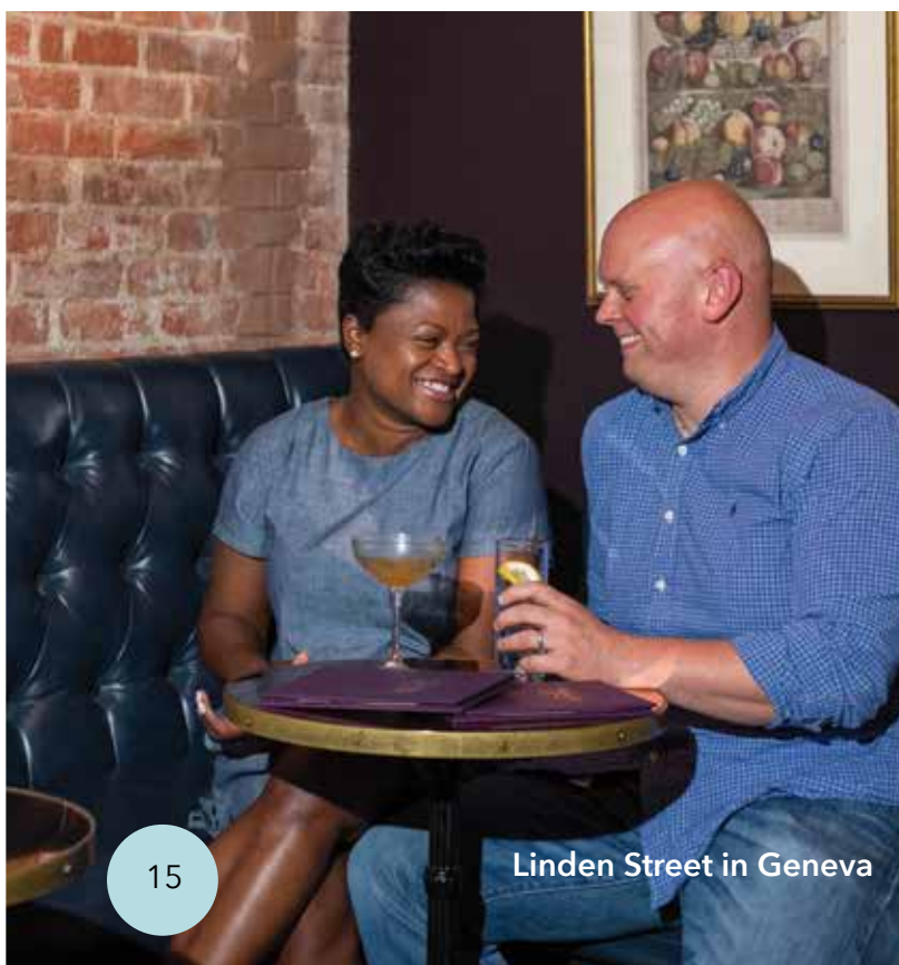
Linden Street in Geneva