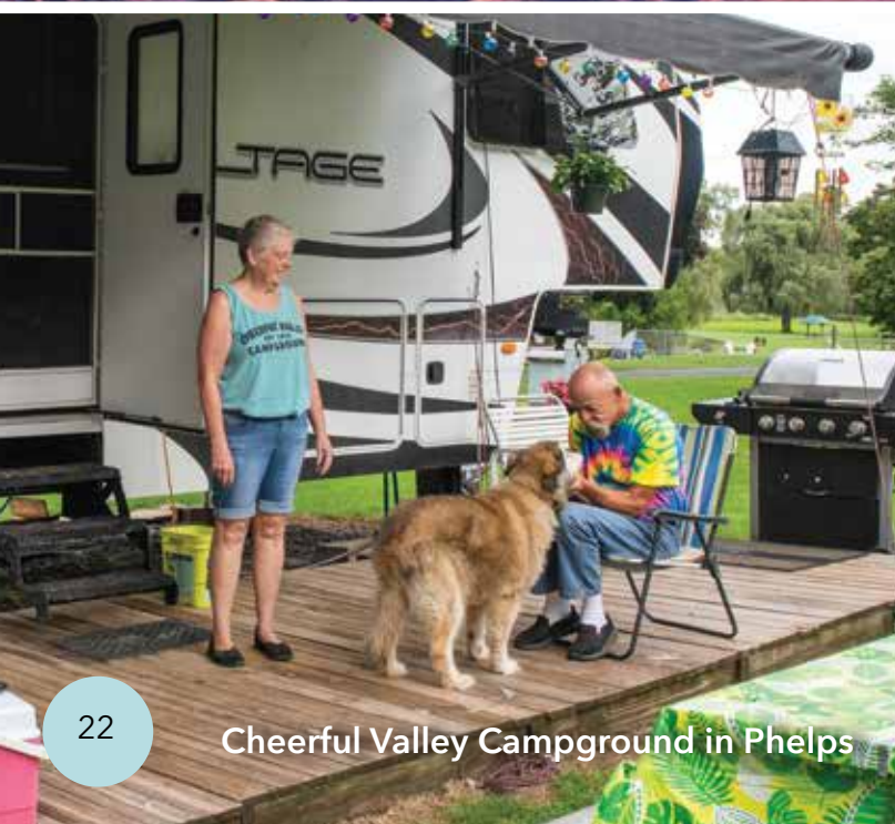
Cheerful Valley Campground in Phelps