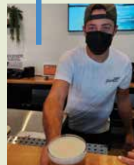
Frequentem Brewing, Co., Canandaigua