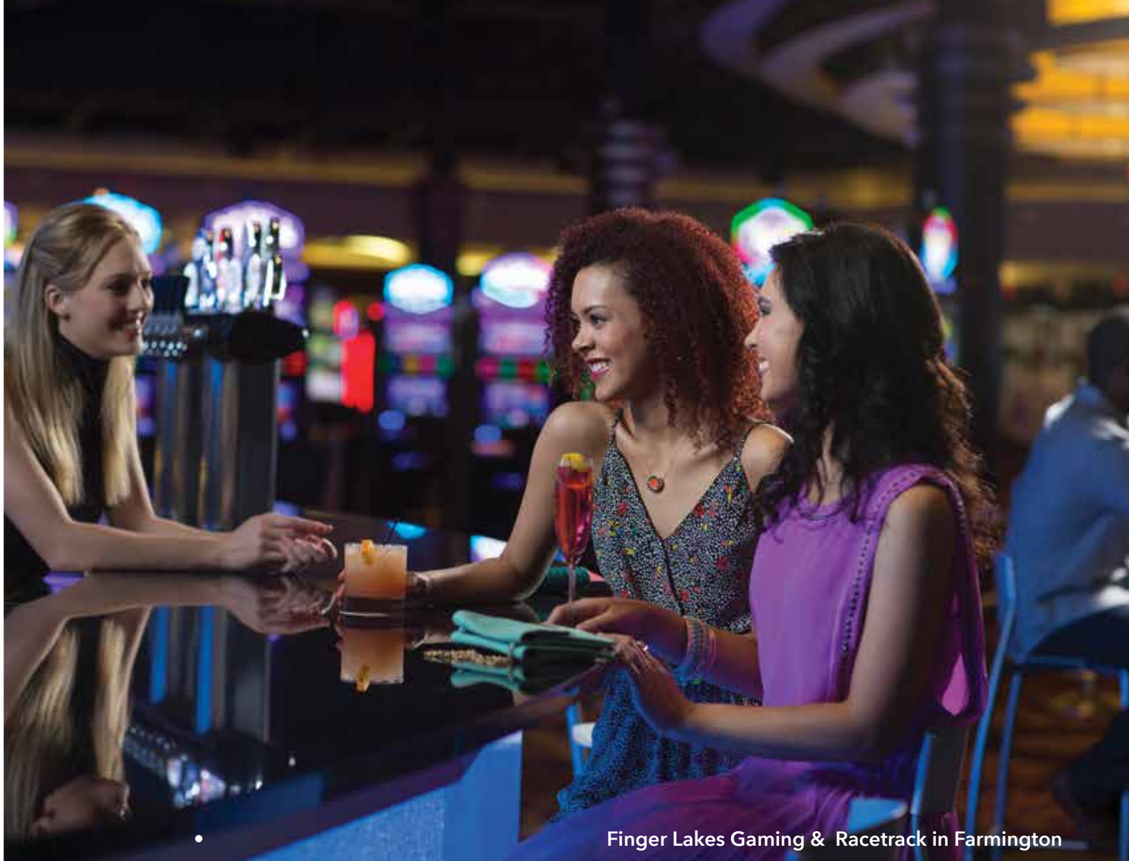
Finger Lakes Gaming & Racetrack in Farmington