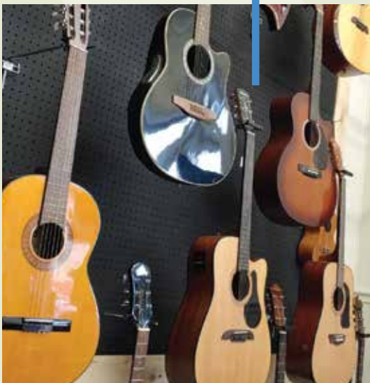
FLX Music Supply, Naples