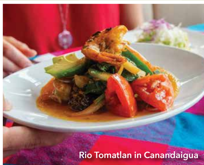
Rio Tomatlan in Canandaigua

Experience the soul-satisfying combination of a burger and local craft beer, or a glass of wine paired perfectly with a charcuterie plate featuring local meats and cheeses. We know you're excited to feast on mouth-watering Finger Lakes-made food. Come hungry because you're in for a treat.