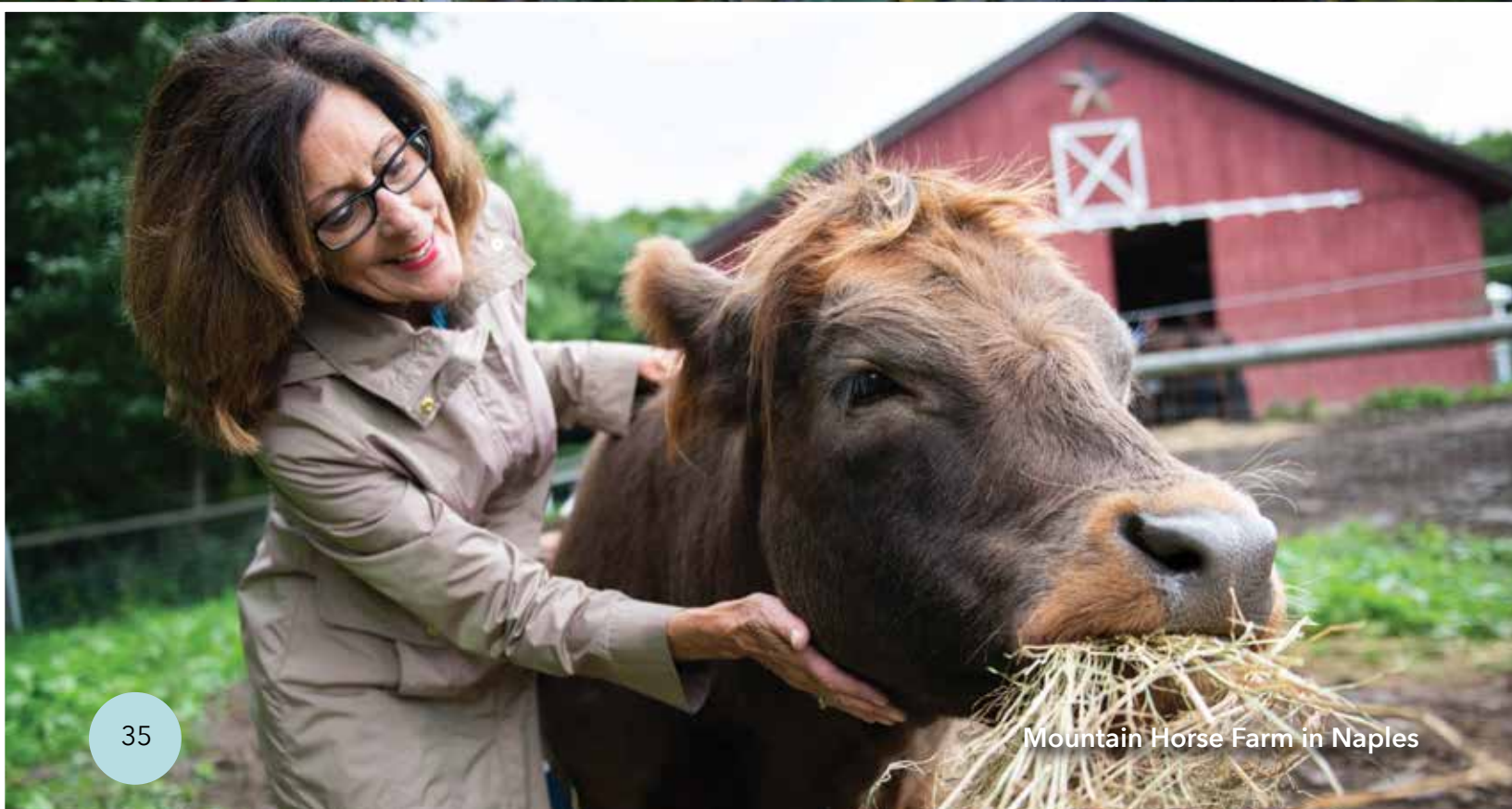
Mountain Horse Farm in Naples