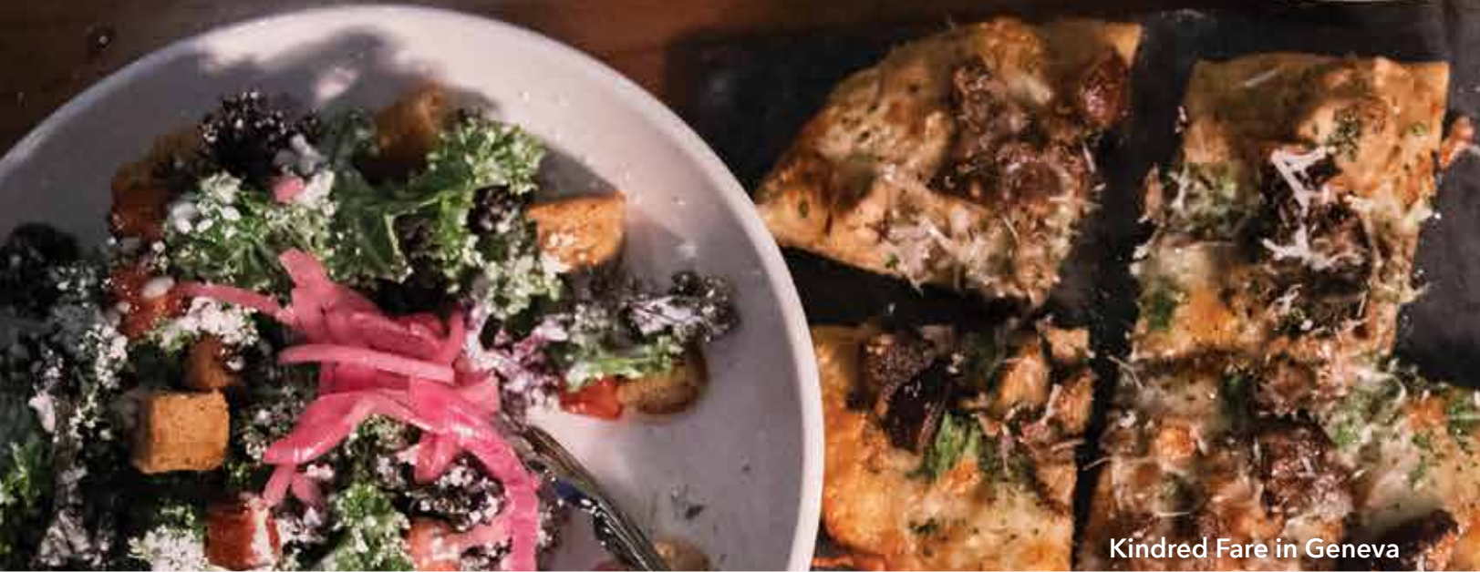
Kindred Fare in Geneva