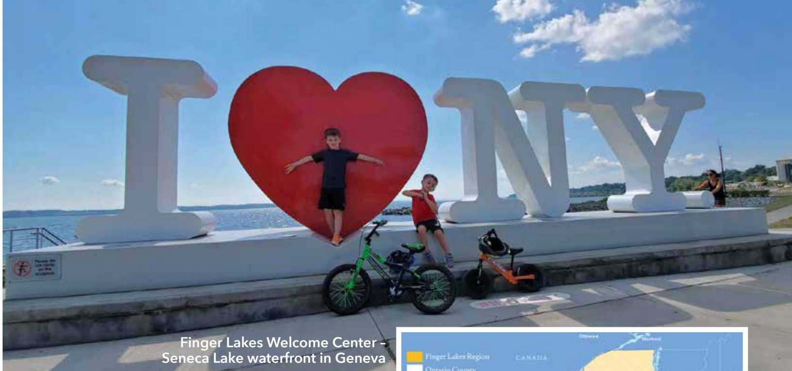
Finger Lakes Welcome Center - Seneca Lake waterfront in Geneva