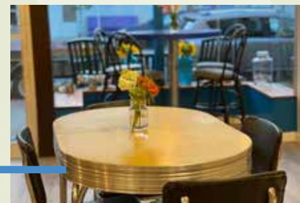
Caruso's Café, Naples