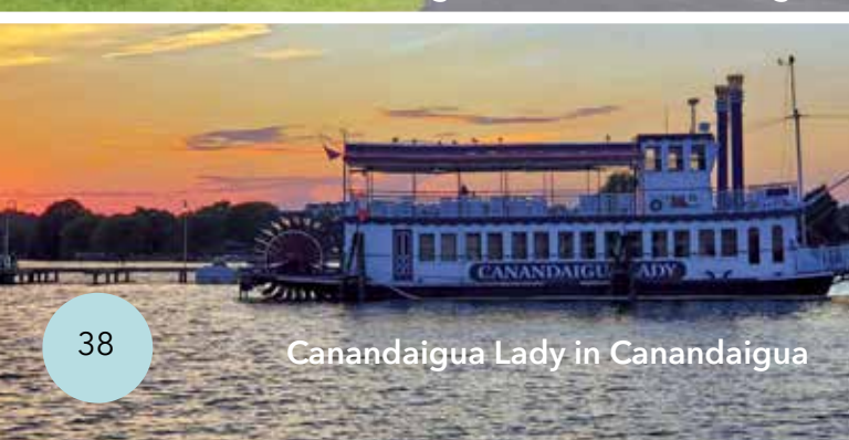
Canandaigua Lady in Canandaigua