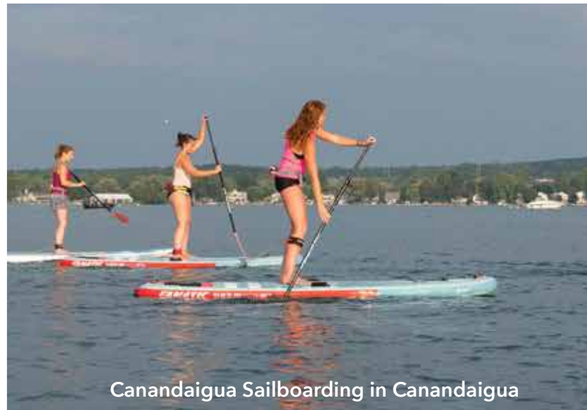
Canandaigua Sailboarding in Canandaigua