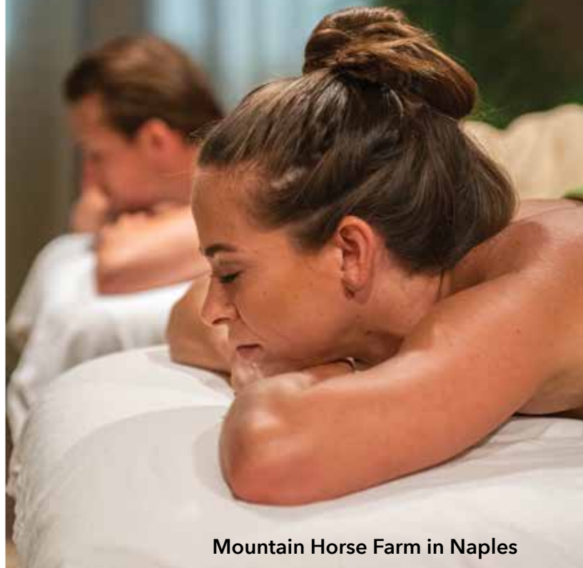
Mountain Horse Farm in Naples

Find your bliss... just be forewarned, you may never want to leave.