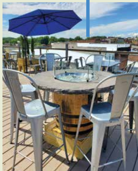
SkyDeck at Nick's Chophouse, Canandaigua