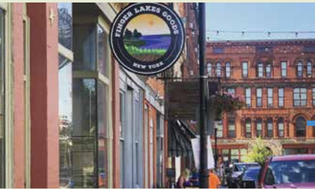
FLX Goods, Geneva