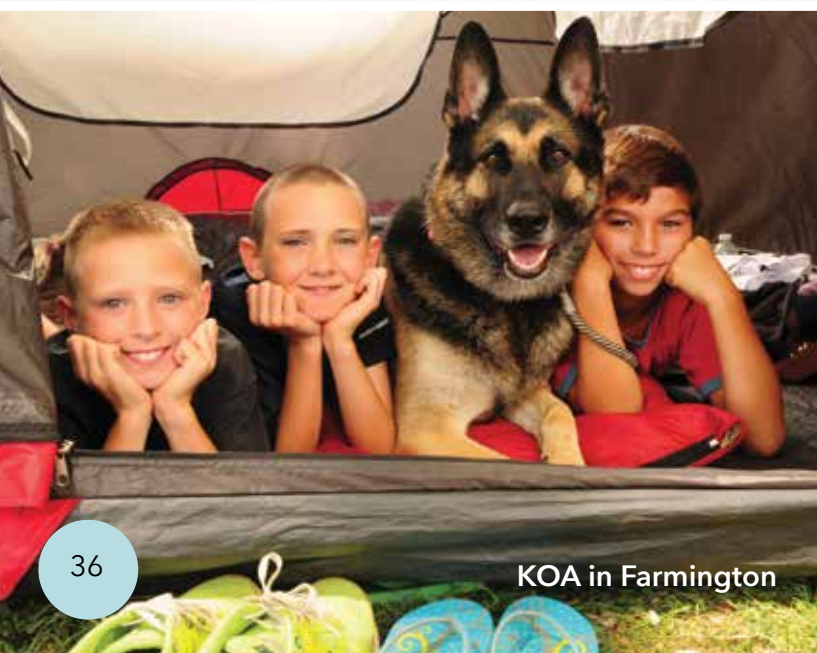
KOA in Farmington