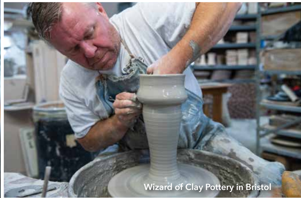
Wizard of Clay Pottery in Bristol