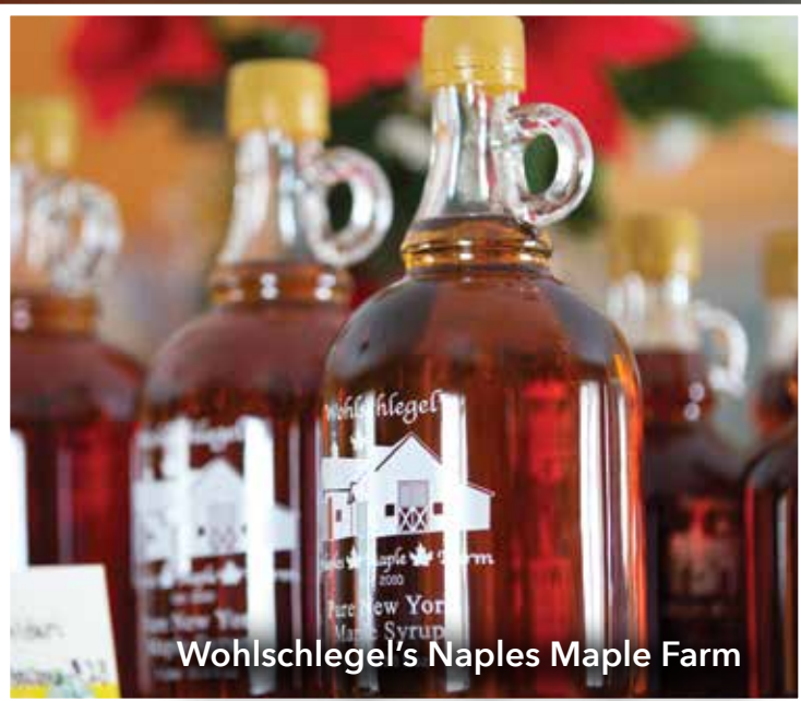
Wohlschlegel's Naples Maple Farm

In the Finger Lakes, we believe it's important to know where your food comes from. Nothing beats farm fresh products harvested by the folks who have been growing in the region for generations. "Farm to plate" is not just an idea here, but a way of life.