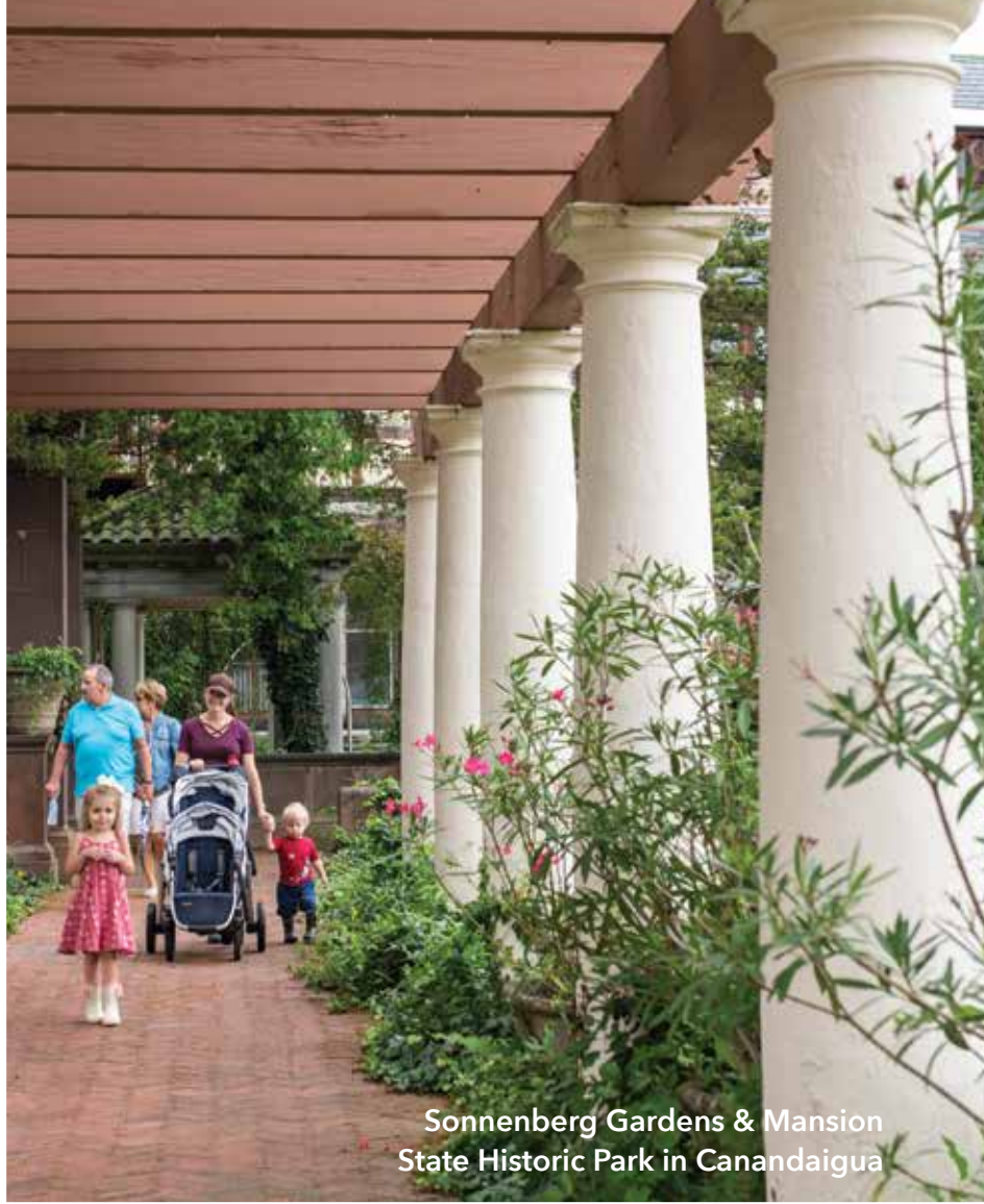
Sonnenberg Gardens & Mansion State Historic Park in Canandaigua