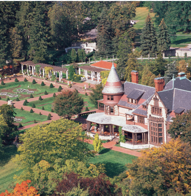
Sonnenberg Gardens & Mansion State Historic Park, Canandaigua, NY

We've planned themed motorcoach group itineraries for you that are timed out and ready to be booked. Three snapshot versions are here but you can see the complete versions with booking details by visiting us at VisitFingerLakes.com/groups or give us a call 877-386-4669.