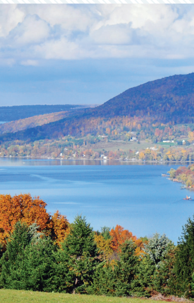
Perfect picture spots throughout the Finger Lakes

VisitFingerLakes.com/groups/itineraries/castles-lakes-and-grapes