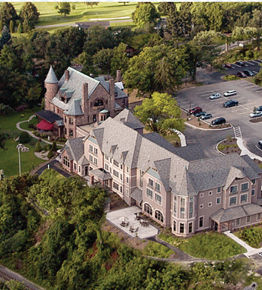
Belhurst Castle and Winery, Geneva, NY

VisitFingerLakes.com/groups/itineraries/vintage-classics